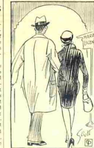
Isn't it strange how a man will chase a girl until she catches him.