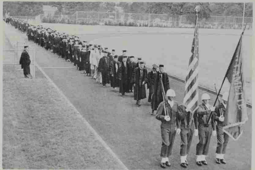
Faculty and students marched in academic procession into McCulloch stadium.