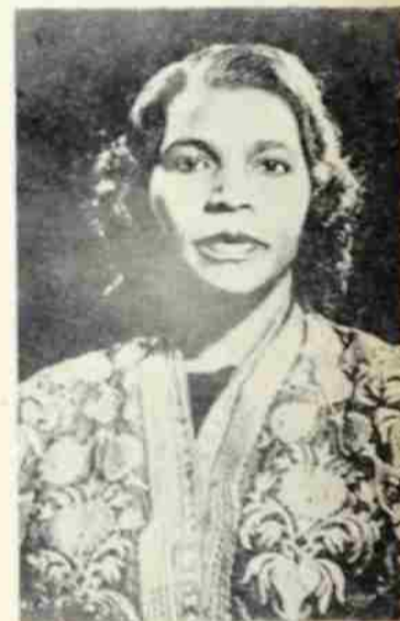
MARIAN ANDERSON Famed Contralto to Appear