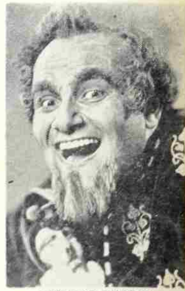
LEONARD WARREN Opera Man Next

Other celebrated stars to appear during the 1957-58 season at the