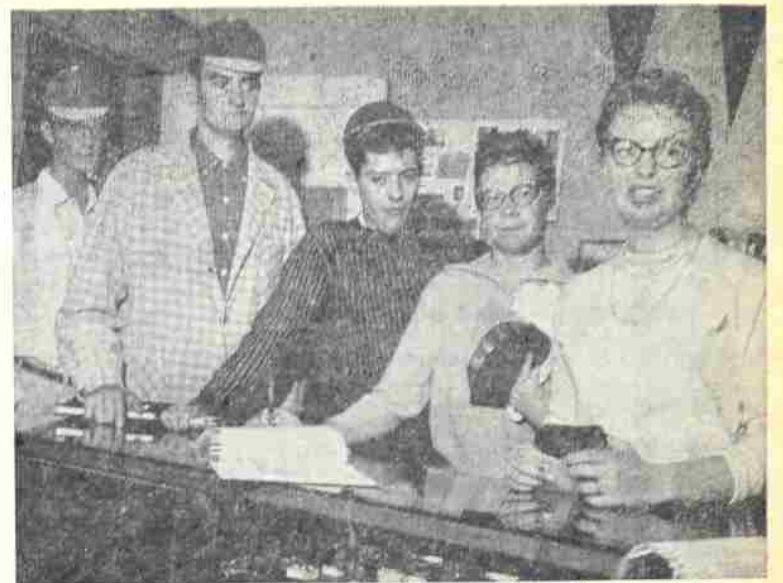
All too typical of Willamette students this week were scenes like this one in the book store. Severe cases of standingitis and fallen arches were reported after hours in waiting for those precious books and more precious fee slips. With the end of this week, however, even the freshmen are old hands at the first fall fluster of getting back in the old swing of school life.