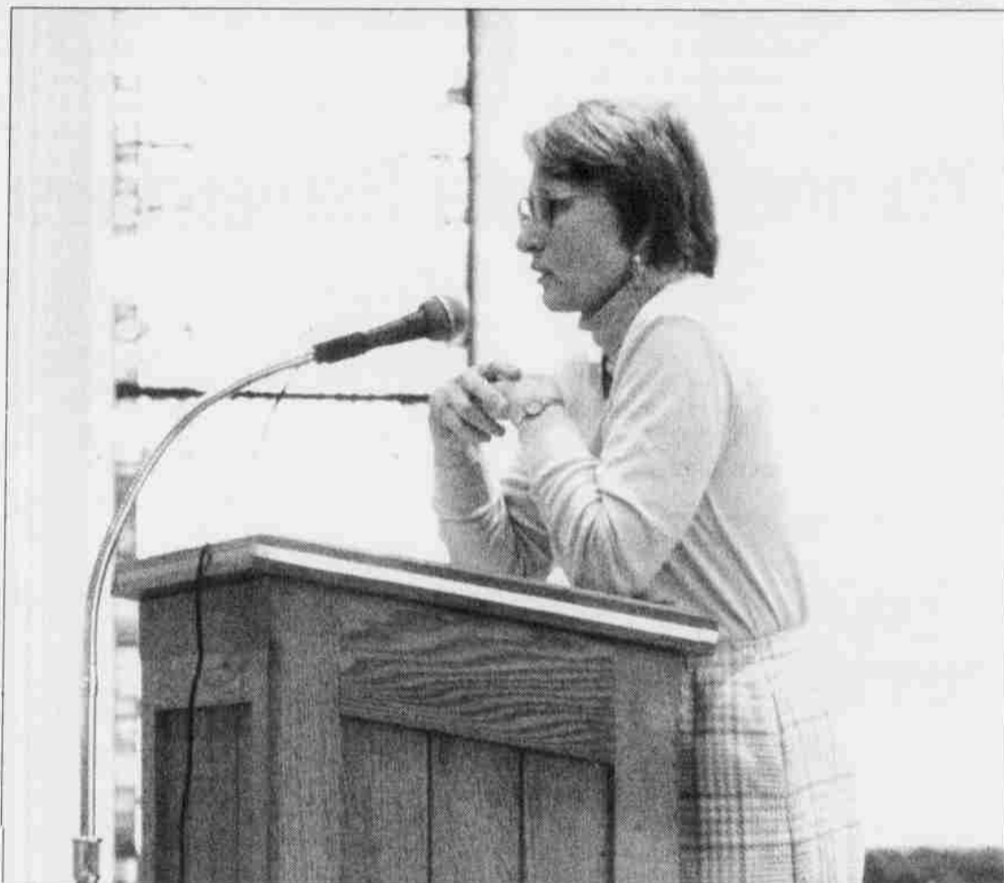
MERCHANT OFFERS LEGAL MEANS--"We must rally the people of the United States to support a Clean Earth Amendment to the Constitution."

Merchant authored The Death of Nature and Ecology and the Scientific