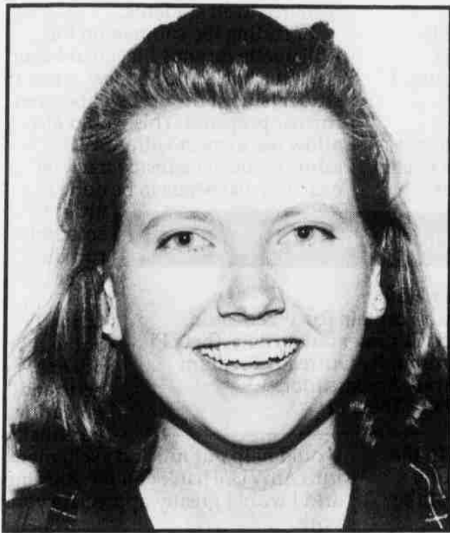
Major: International Studies and History Class: Junior

For the past three years, the answer to the $150 question on the $10,000 pyramid of ASWU has eluded me. It's not that I don't have an idea of what the answer should be, it's that I haven't been able to express it. My positions within the pyramid have given me a broad base of experience from which to draw and also ideas for improvement and enhancement. As your ASWU Secretary, I will be able to infuse this position and this campus with a greater sense of accountability, which I believe to be the answer to the question.