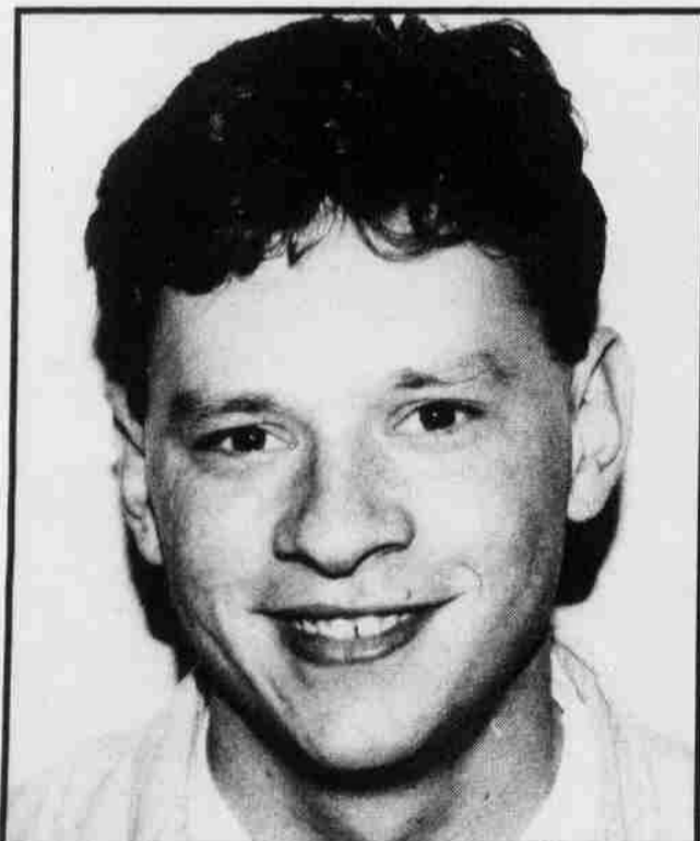
Major: Economics Class: Junior