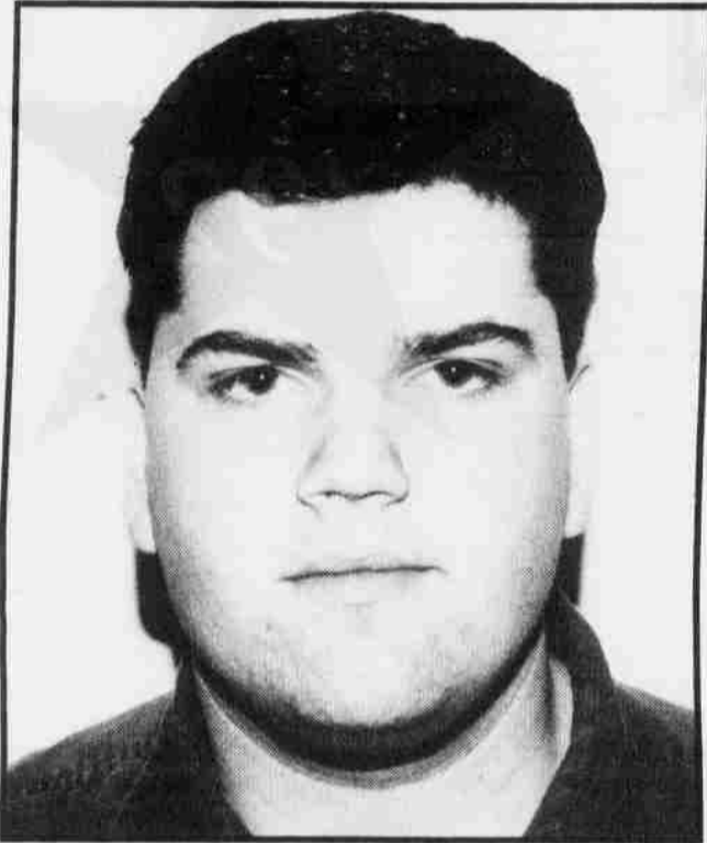
Major: Speech Communications and Political Science Class: Junior

Perspective. Over the years, I have talked with enough students to know that everyone has an opinion, and it is usually different from your next door neighbor's. When I was involved in the Theater Department I heard student's views on issues ranging from the Collegian to the Bachelor of Theater. When I played football, I had the chance to hear how athletes feel about everything from the weight room to tuition. In hall government, it was the alcohol policy and the Womyn's center. Most recently, as an RA, I have had the opportunity to hear about everyone's feelings on just about everything else. My point: when looking at the issues on campus, it is very important to examine them from all perspectives.