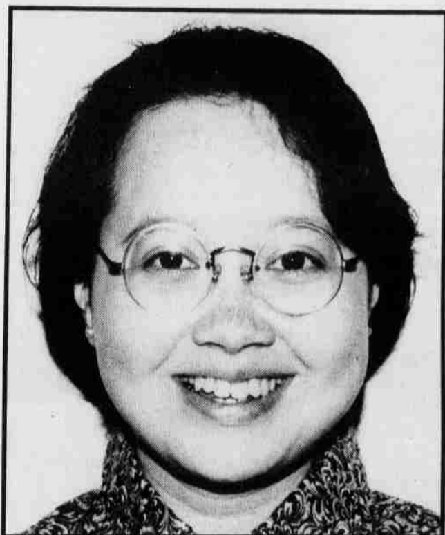
Major: Speech Communications and Political Science Class: Junior

Three years and three Presidents later, I have learned what works and what doesn't in representing student interests to the administration. The President of ASWU is responsible to the students for advocating their concerns and interests to the administration. On my part this requires sincerity, approachability and preserverance in advocacy.