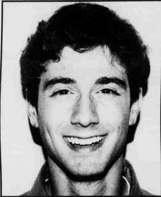
Major: Speech Communications and Political Science Class: Sophomore