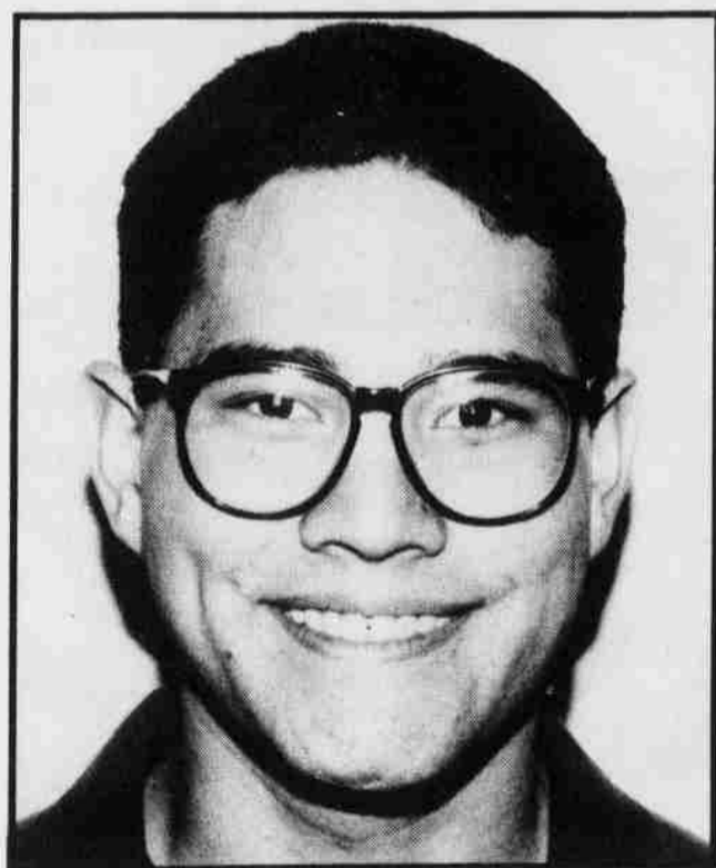
Major: Political Science Class: Junior

Apathy is the biggest, nastiest, and most painful pimple on Willamette University's ass of progress. But how did it get there? The student body's voice has been unfairly silenced. Without that voice, there is no progress for the students or the Willamette community. Increasing the effectiveness of Associated Students of Willamette University, establishing the necessity of accessibility, and recognizing the equality of ideas will help relieve this reoccurring discomfort on campus.