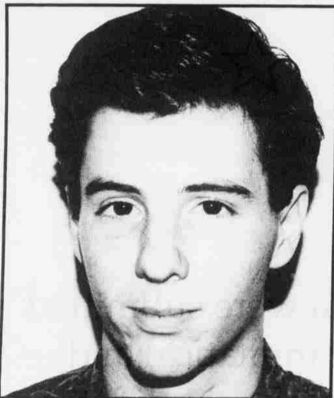
Major: Undecided Class: Freshman