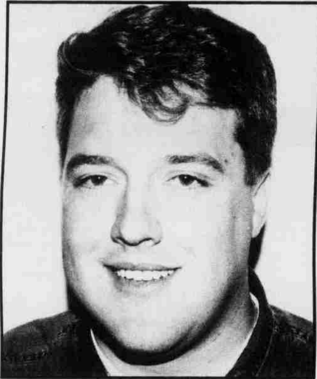
Major: Speech Communications Class: Junior

I am prepared to fulfill, and hopefully exceed, your expectations as President of ASWU. I have the qualifications and experience that will make it possible for me to make a difference as the Student Body President. If I am elected to this office I will have one main goal: