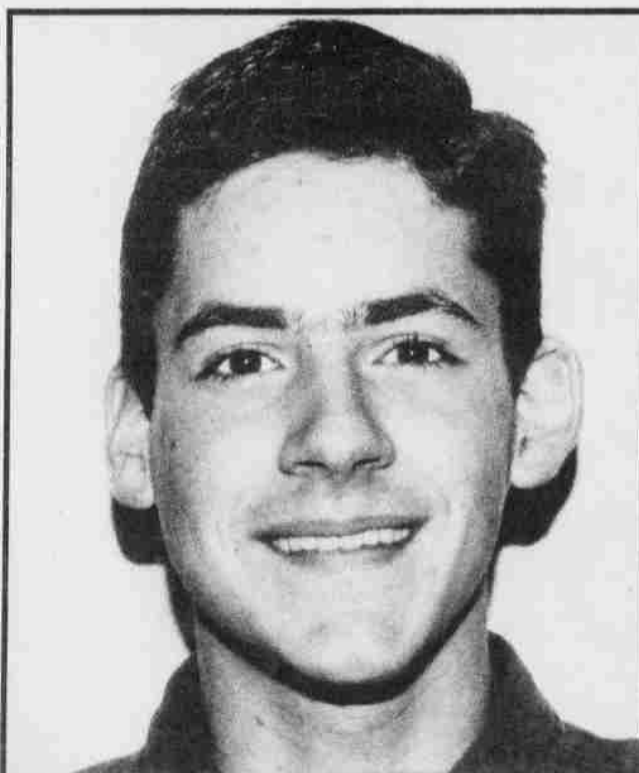
Major: Political Science Class: Sophomore

The position of Treasurer is one which demands experience, perhaps more so than any other ASWU position. The successful management of ASWU finances included much more than a simple job of accounting for a one year term. In addition to the day to day "number crunching," the Treasurer must be familiar with several things.