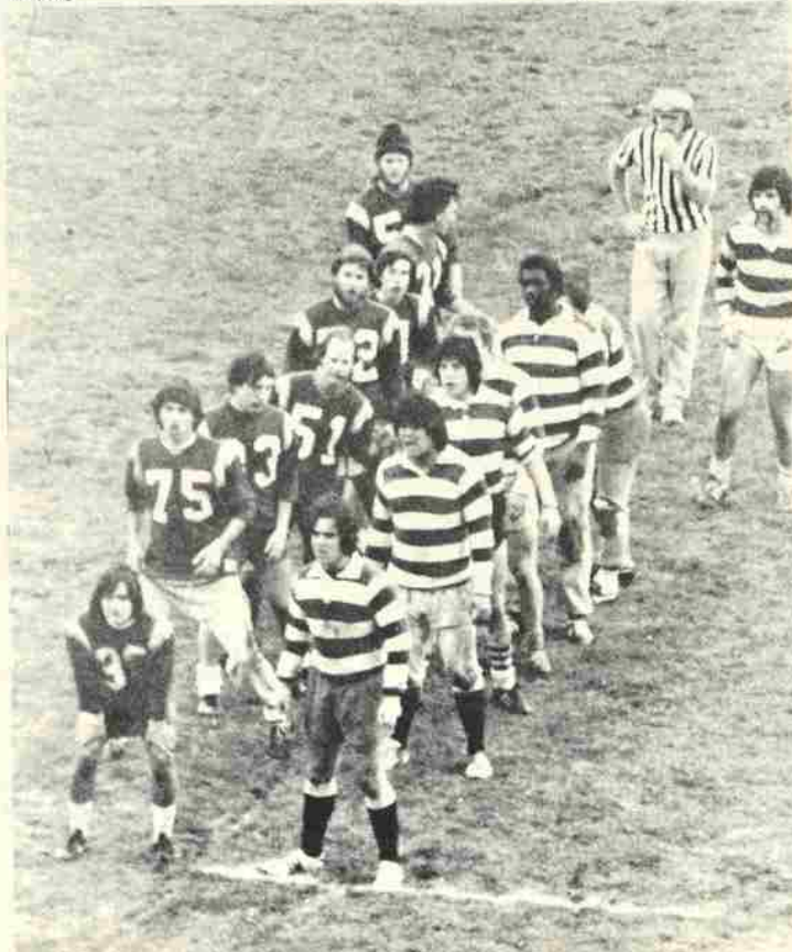
Willamette's rugby team overpowered Reed Saturday in their first home match of the season.