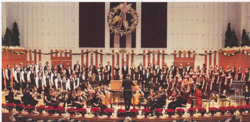
Annual production of Christmas in Hudson

Founded in 1842, Willamette was the first university established in the western United States. Oregon's capital city is home to Willamette University's 2,700 students and 300 faculty members across its undergraduate college and graduate schools of law and management.