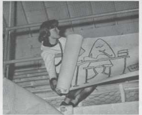
Last minute preparations.