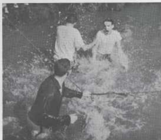
Don't hold up the traffic.