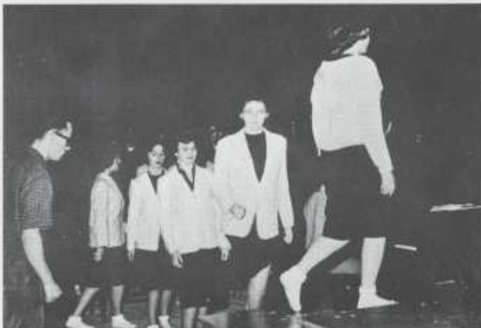
"And smile please!"