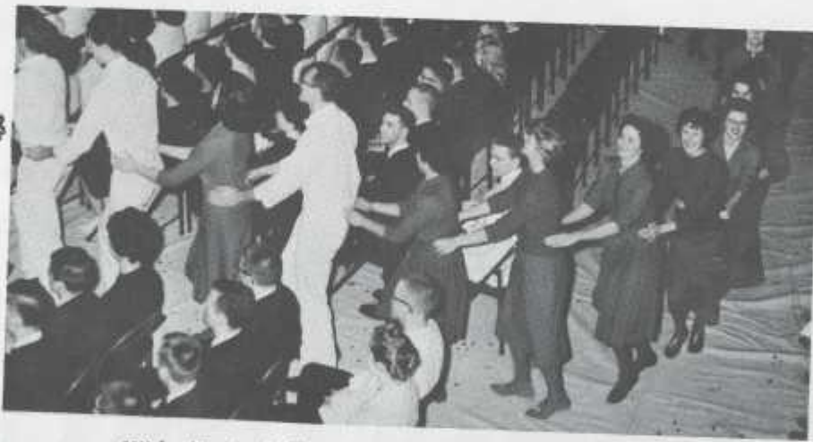
With dignity befitting their station, the juniors enter.