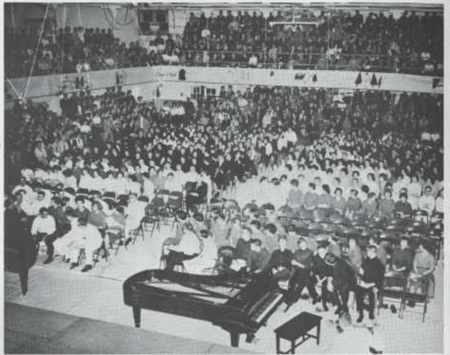
This is Glee.