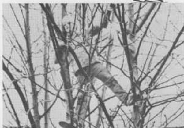
Darwin's Theory of Evolution?