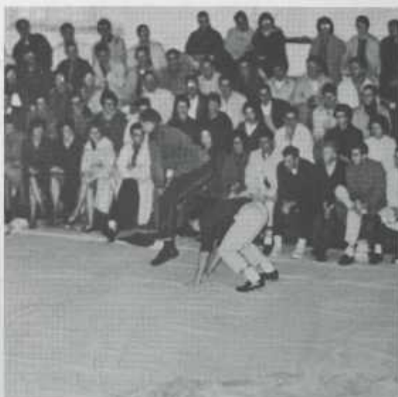
1 . . . 2 . . . 3 . . . Leap.