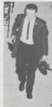
Souvenir Photographer: Burr Baughman.