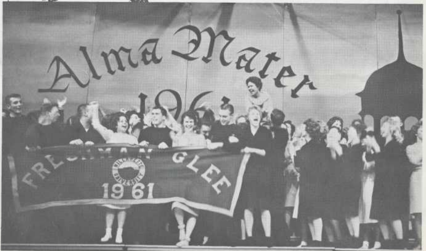
With their song leader aloft, the sophomores celebrate their victory.

Here's your 1961 Alma Mater Freshman Glee Souvenir in pictures. From 1908 to 1961, our W.U. Freshman Class has presented its annual inter-class battle in song. Members of our classes write the songs, design the formations, and then, on Glee Night, present their musical creations in competition with the other classes. As the high-point of Willamette traditions, our Glee has something to offer to everyone. To our spectators, we offer an entertaining evening; to the winning class, possession of the coveted Glee Banner; to the losing class, a free, guided tour of the Mill Stream; and finally, for everyone, the chance for class competition and a good time.