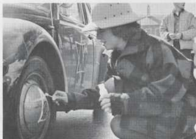
Artist? at work.