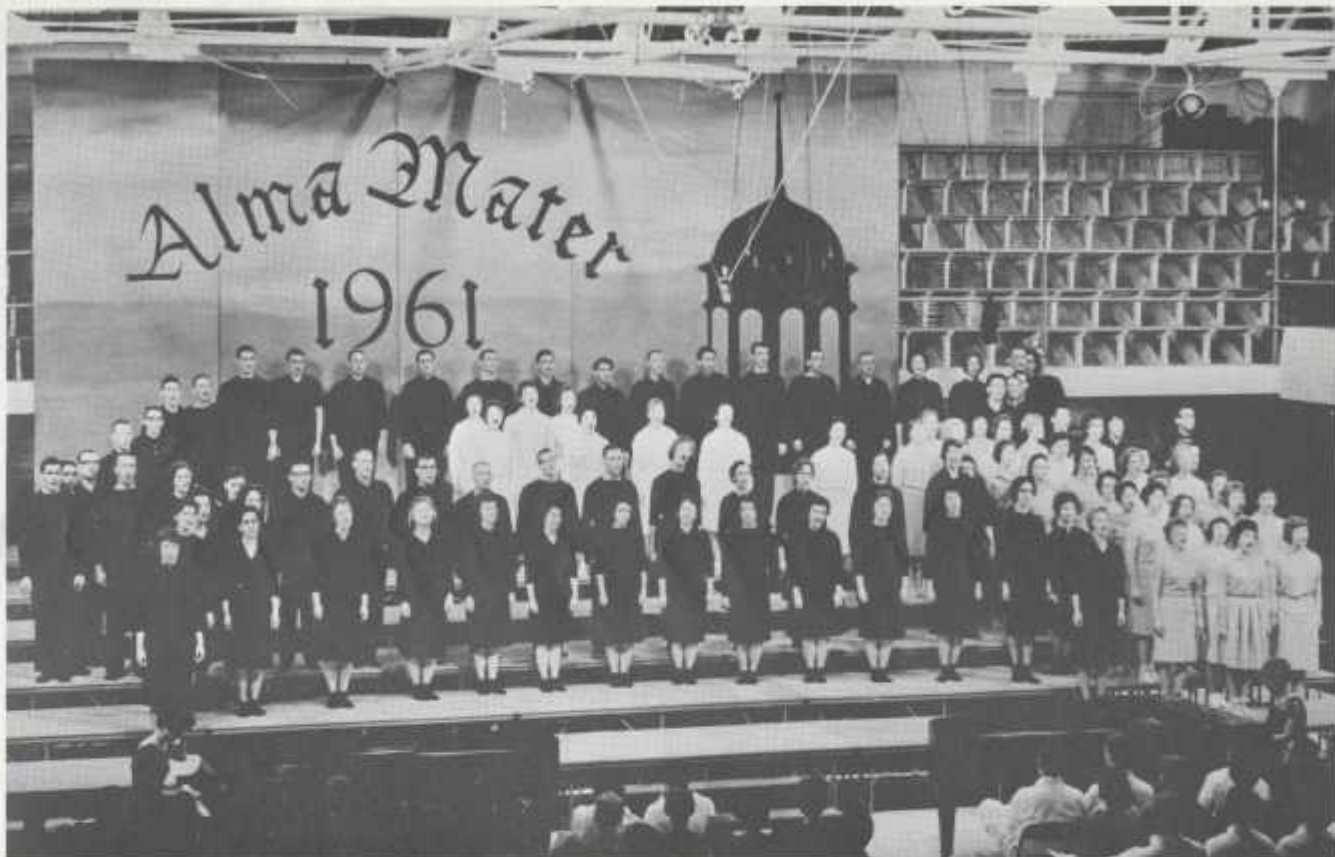
A victory for the sophomores was won with, "Symphonyin Trust," and a black, white and gold mortar board.