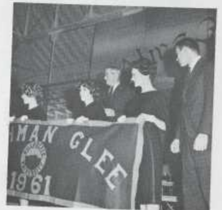
"Schulze talks on tonight."