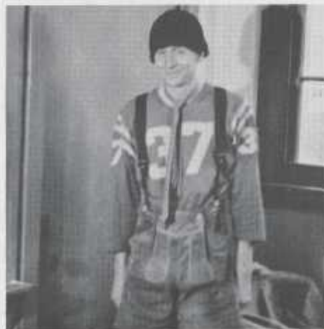
What some people won't do for a Glee bet.