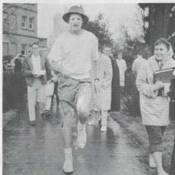
Trip 2 . . . 3 . . . 4.