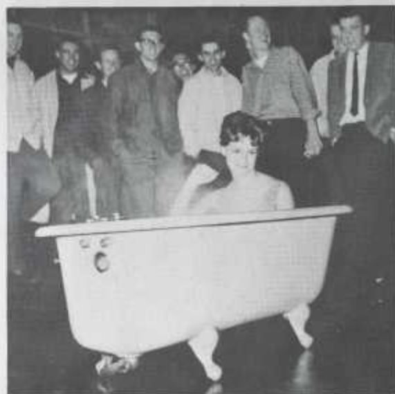
"Splish-Splash, I was taking a bath!"