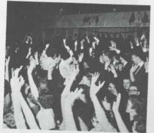
Seniors predict their own fate.