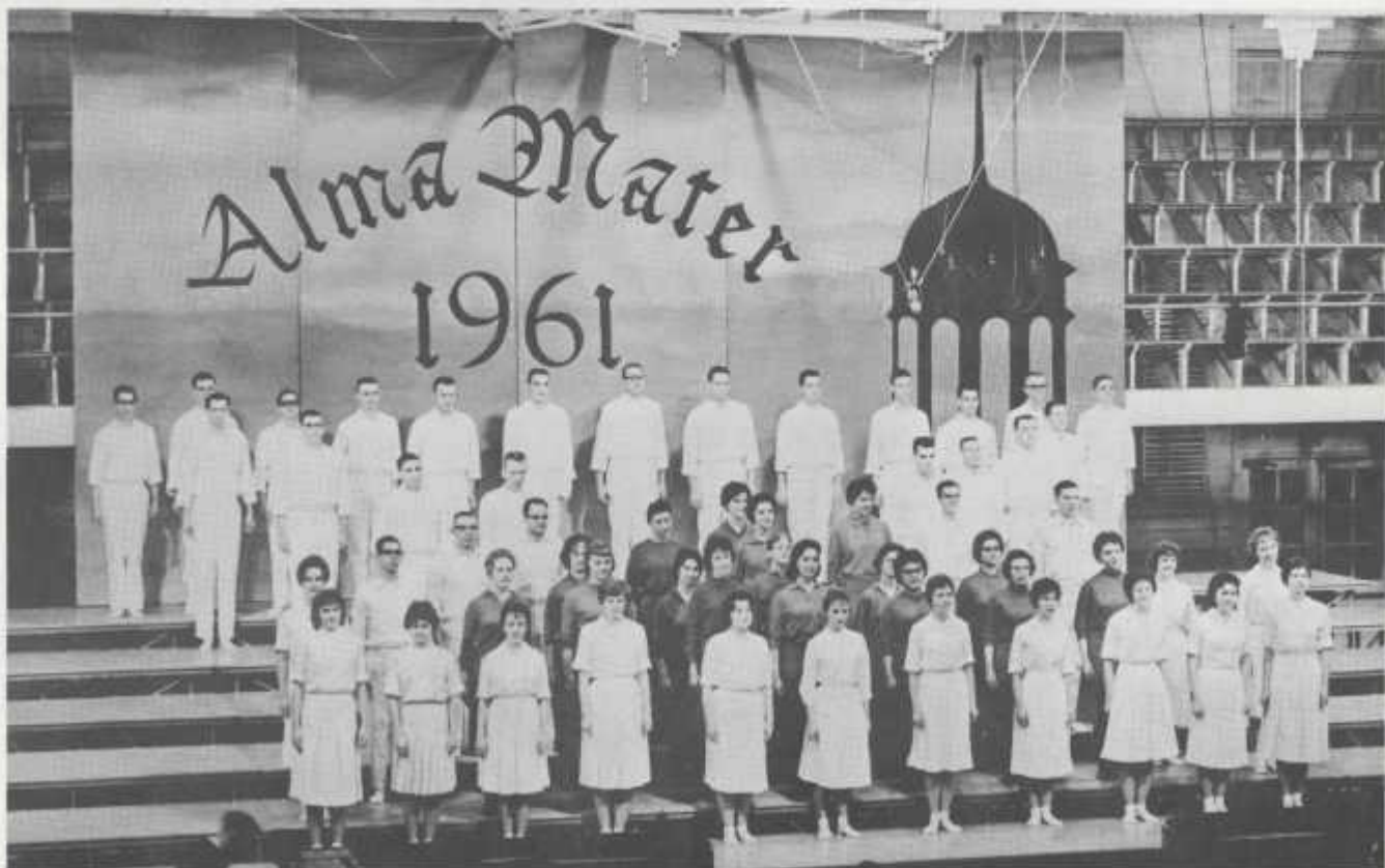
"The Spirit of Willamette" is sung by the juniors with an hour-glass formation.