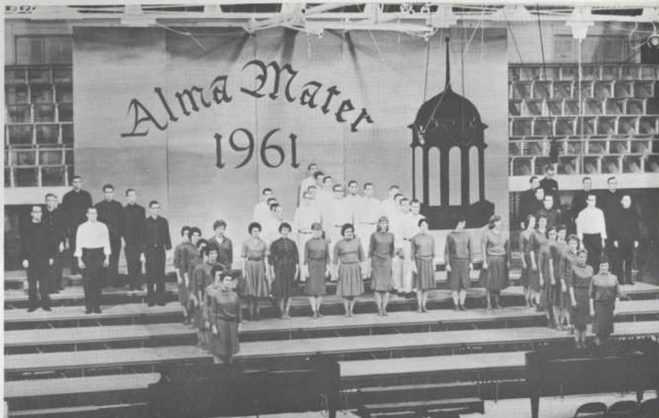
With the spire of Waller and two bells, the seniors sing "To the Spires of Willamette."