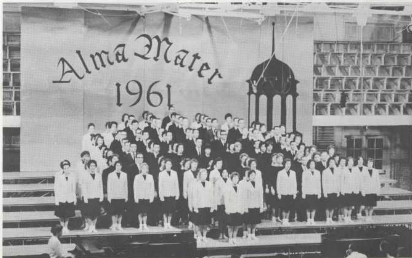
"To Willamette" is sung by proud freshman as they depict the bell of Waller Hall.