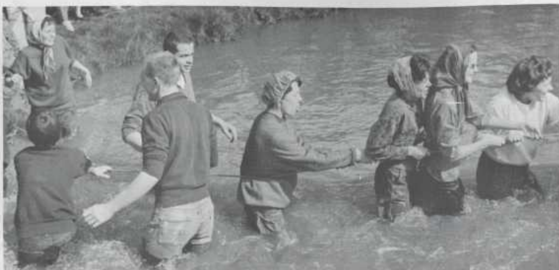
"Throw the seniors in the stream! Let's keep Willamette clean!"