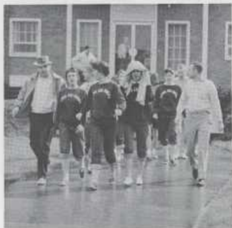
Mill stream bound.