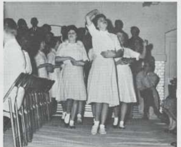
"Make way, make way, for the Junior Class; we don't care if we come in last!"