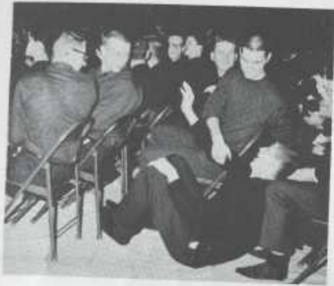
Sophomore finds floor . . .