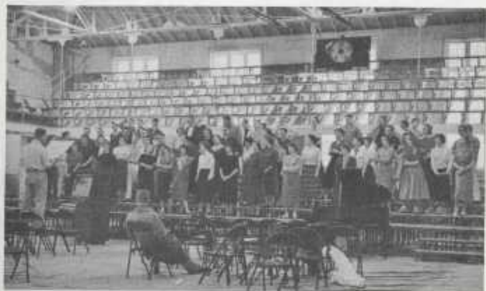
The seniors actually rehearsed!