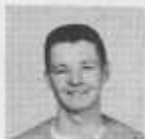
Don Gordon Entertainment