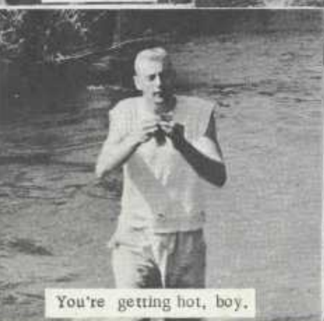
You're getting hot, boy.