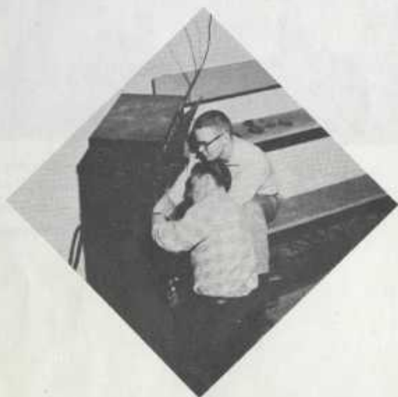
The lighting committee hard at work.