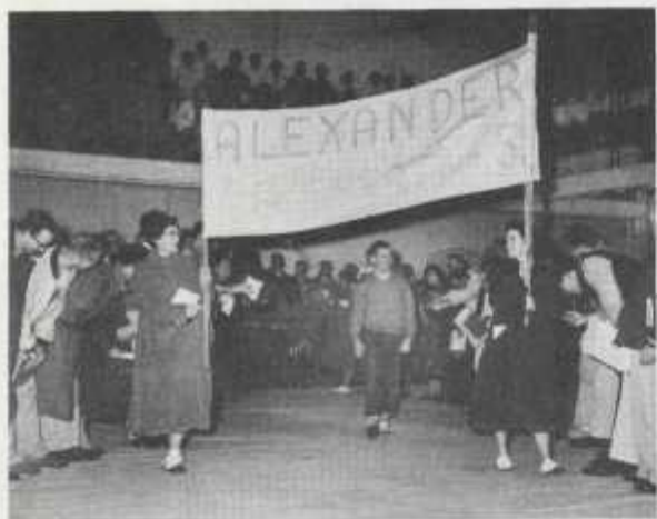
A Royal Salute