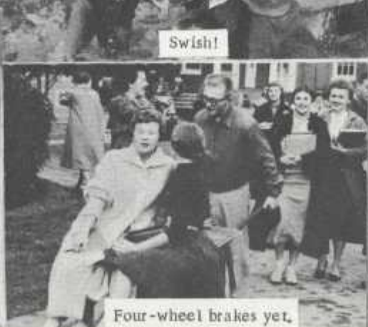
Four-wheel brakes yet.