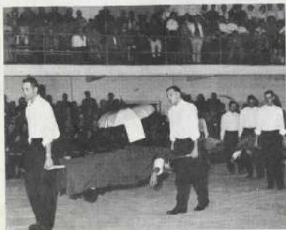
Dearly Beloved. . .