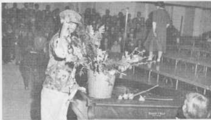
The stage crew prepares the gym for Gtee.