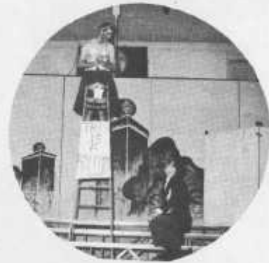
Time out for culture (?)