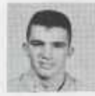
Tom Weston Chairs & Floor