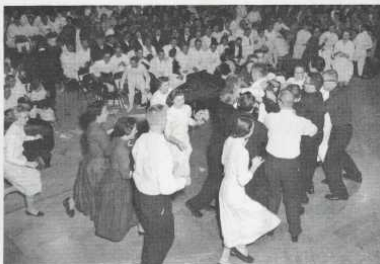
Jubilant Frosh rush for the coveted banner.