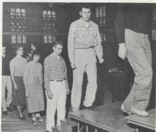
One, up, three, four.