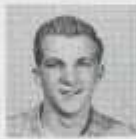
Ted Cook Tickets