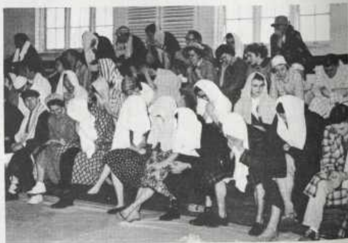
Seniors Anticipate a Wet Day