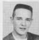
Wendell McLin* Stage