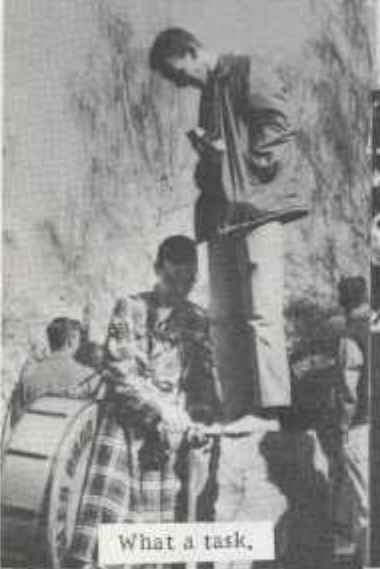
What a task.