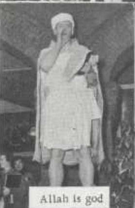
Allah is god