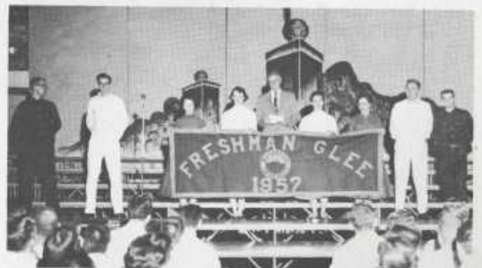
The coveted Glee Banner waits to be claimed by the victorious class.