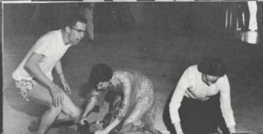
The washing is soon to come.