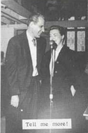
Tell me more!