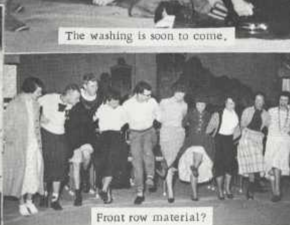
Front row material?