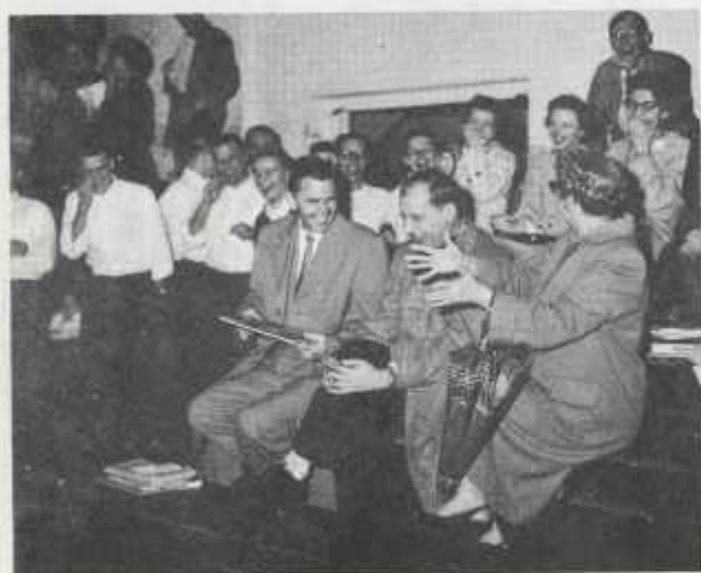
Saturday Review of Literature