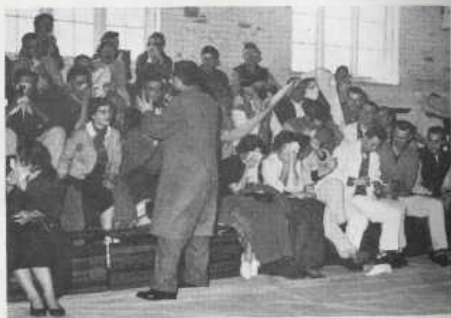
Song Of Sorrow