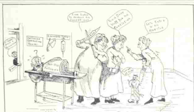
That Orgy of Co-Ed Journalism

The University of Washington baseball team was in the valley the past week, playing two games with the University of Oregon and two with O. A. C. The first contests occurred at Eugene, where the team from Seattle won on Wednesday by a score of 5 to 1 and met defeat the following day to the tune of 6 to 1. Friday and Saturday, Corvallis was invaded by the delegation from the Sound. They repeated their Eugene performance, winning one game 14 to 1 and losing the other 10 to 5.