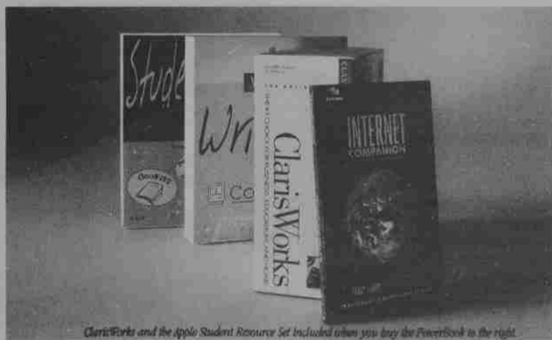
ClarisWorks and the Apple Student Resource Set included when you buy the PowerBook in the right.

(Buy one now, and we'll throw in all this software to help you power through college.)