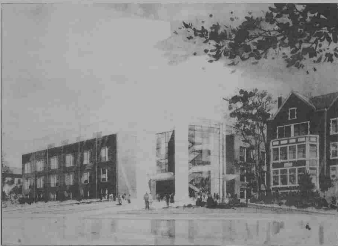
When completed, the front of the new Olin Science Center, which will be located between Lausanne Hall and the art building, will look like this architect's rendering. Courtesy of Soderstrom Architects.