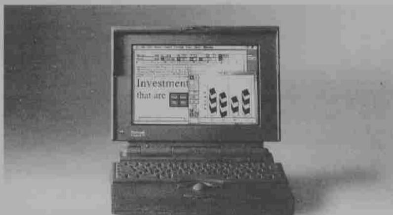
Apple PowerBook 150 4/120. Only $1,260.00.

When you weigh the options, it's quite possibly the best deal available for college students. For a limited time, buy a select Apple PowerBook at a special student price and get a unique new student software set available only from Apple. It's all the software you're likely to need to breeze through college. You'll get software that takes you through every aspect of writing papers, the only personal organizer/calendar created for your student lifestyle and the Internet