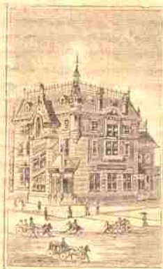
COLLEGE OF MEDICINE PORTLAND, OR.

Oldest, Largest, Least Expensive and most Home-like Institution of Learning for both Sexes In the Northwest.