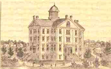
UNIVERSITY HALL, SALEM, OREGON.