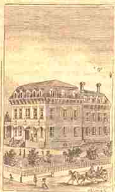
WOMANS COLLEGE SALEM, OR.