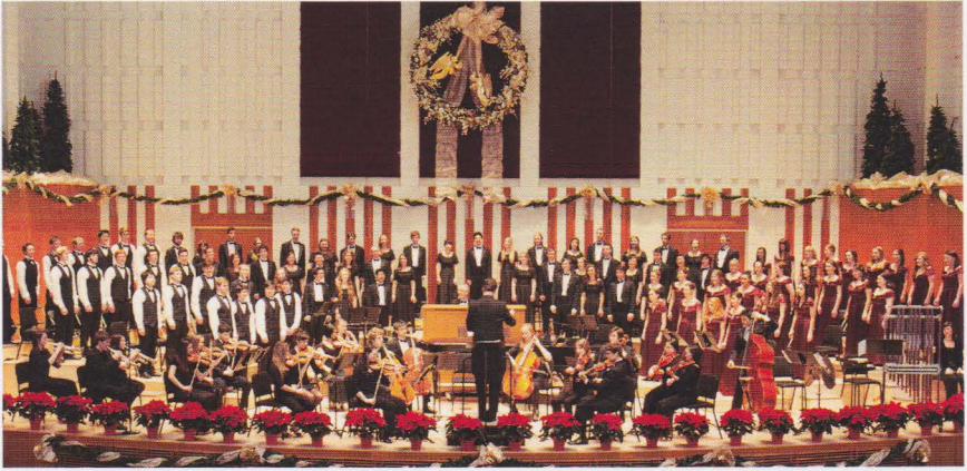
Annual production of Christmas in Hudson

Willamette University is nationally recognized for educational programs that are exciting, intellectually challenging and relevant. The university comprises a premier undergraduate College of Liberal Arts, the College of Law, the Atkinson Graduate School of Management and the Graduate School of Education. Founded in 1842 in the heart of Oregon's Willamette Valley, the university boasts more than 24,000 alumni and enrolls 2,600 new and returning students each year.