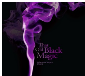
That Old Black Magic , our 24 th CD from the Willamette Singers 2018-19

To order music department CDs please add them to your cart in our online store at Willamette.edu/go/wu-cds . If you would rather purchase your CDs in person, please call the Willamette Music Office at 503-370-6255. Hours: Monday through Friday, 9am - 4pm.