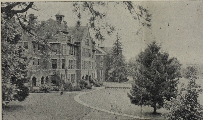
A View of the Campus

MAY FESTIVAL May 5 and 6 COMMENCEMENT June 17, 18 and 19 NEXT YEAR OPENS September 18