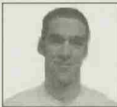
RICH SCHMIDT CONTRIBUTOR

Monday night, 10:30. We set off from Shepard toward the UC. Upon entering, we notice that most of the lights on the first floor are on, including the lights in the front of the bookstore. This allowed us to do some window-shopping, which must have been the