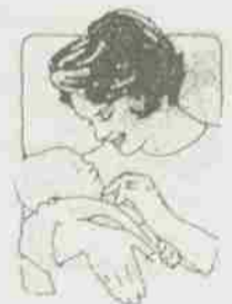
Have the Baby