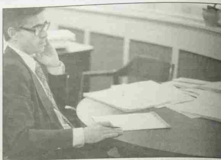
OFFICE OF COMMUNICATIONS