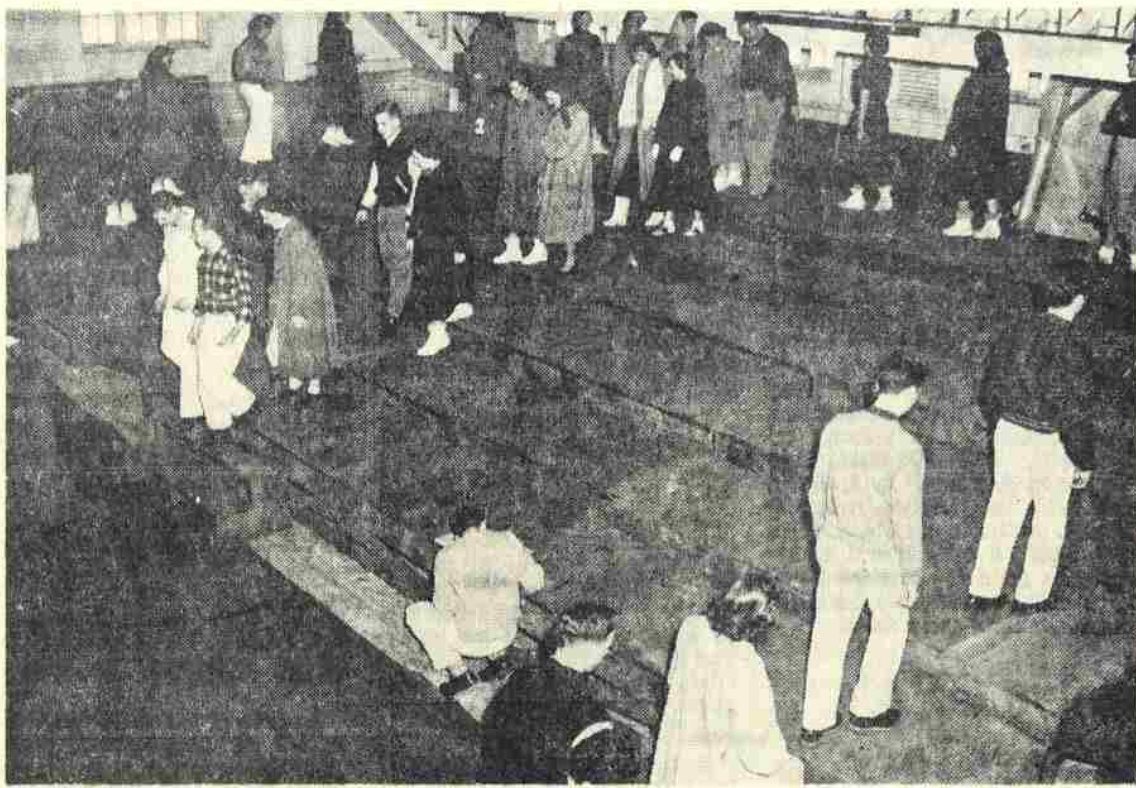
Members of the junior class do a little last-minute practice on marching to put fine edge on execution of formation for forty-third annual Glee tomorrow night. Especially hard to perfect, as all four classes have discovered, is the precision needed in marching on and off the risers.

The 1951 Freshman Glee promises to be one of the most colorful and exciting presentations in the history of Willamette.