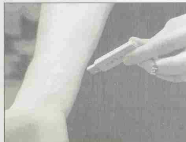
AN INJURED PARTY

Marchmont is under continually observation at the Mental Health Wing of the Salem Hospital for the foreseeable future. As he was being pulled out of the Mill Stream, he turned to crowd of onlookers and mumbled something about shutting up and rebooting.