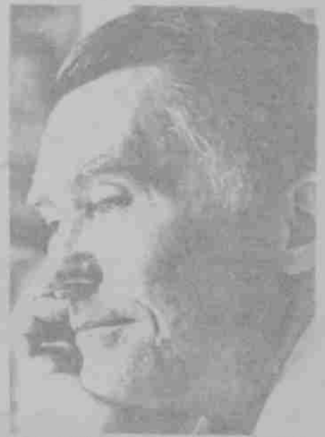
Dr. William Stafford, Oregon poet.