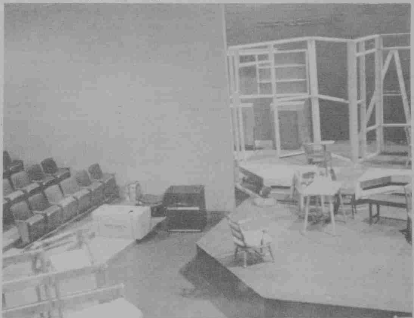
Thrust theatre provides intimate space for actors and audience.