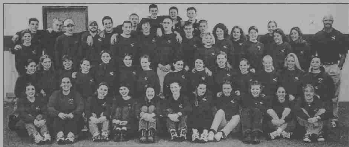
WU Crew poses for a picture in their new Boathouse after recent success against Lewis and Clark College.

The Governor's Cup Regatta will be held April 10th, with a good viewing spot being Riverfront Park.