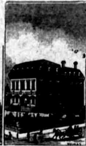
WOMAN'S COLLEGE, SALEM, OR.