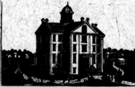
UNIVERSITY HALL, SALEM, OREGON.