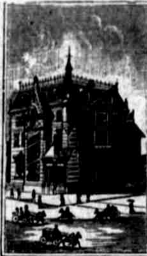
COLLEGE OF MEDICINE, PORTLAND, OR.

No. of Students in attendance last year, 450. Commencement, June 11, 1891. Second term begins, November 13, 1890.