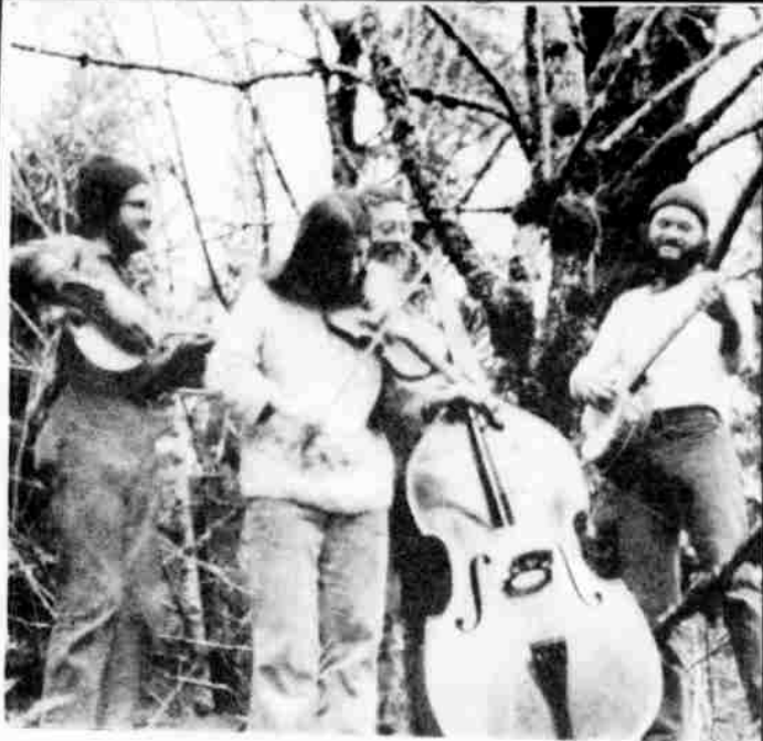
Briarrose is coming to Willamette December 14. You'll all come, too. For an evening of Bluegrass music in the Cat. Brought to you courtesy of Lumina. Admission $0.05.