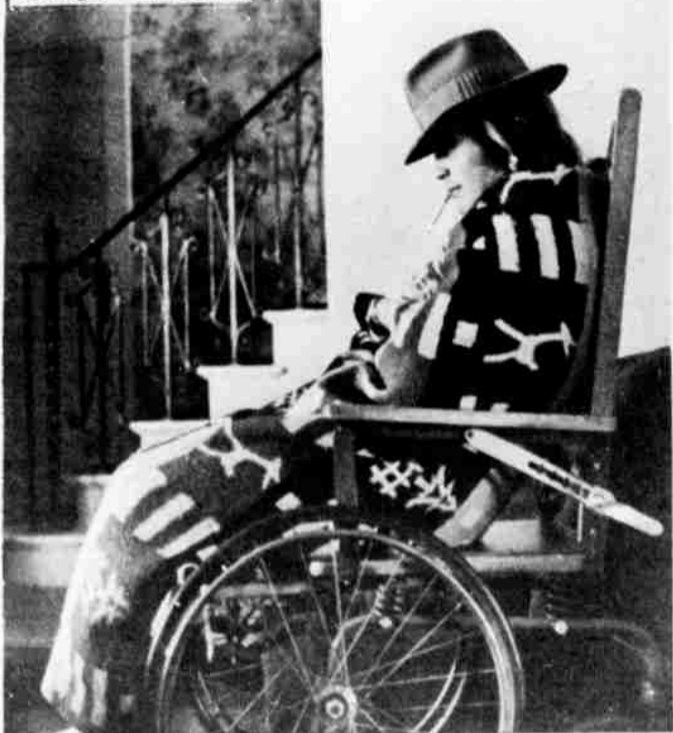
Goodnight Chumly .....