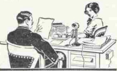
THE BUSINESS MAN

All events in the regular track calendar with the exception of the 50-yard dash and the 2-mile run, will be held. The events open to all comers are three 100, 220, 440-yard dashes; the half and mile runs; 120 and 220