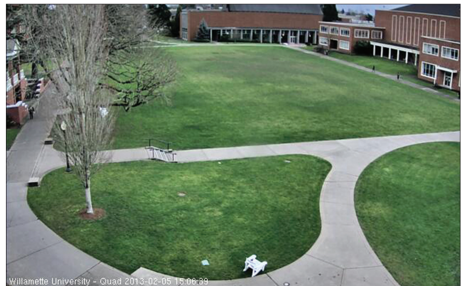
Willamette University - Quad 2013-02-05 15:08:39

Despite these details, one fact still remains. At a school of 2,000 undergraduates, priding itself in a supposedly intimate and dynamic educational environment, the powers that be still feel the need to watch us from above, as if we are some breed of studious, rain-drenched ants in a historic, red-brick terrarium.