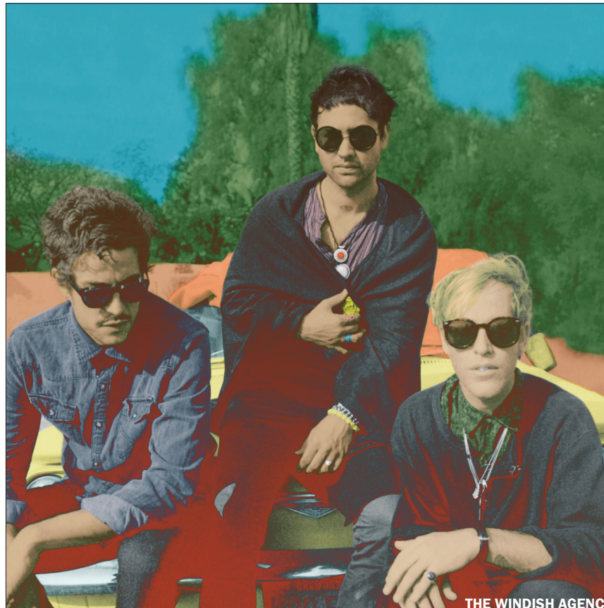
UMO released their sophomore album on Feb. 5