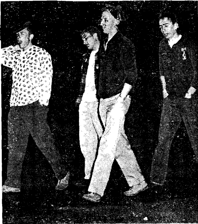
BEAUTY SLEEP goes by boards in weeks prior to "Glee" as students wandering in early morning's darkness indicate. Each class is determined to win.

Freshman Glee has been a tradition at Willamette since 1908.