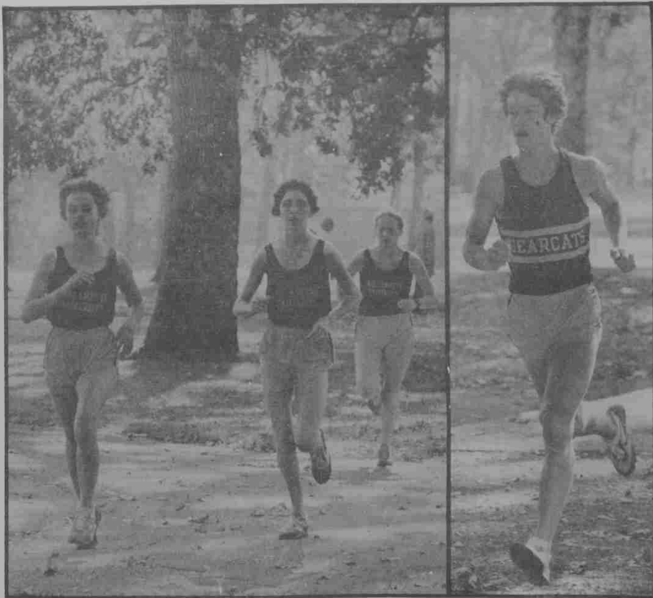
Willamette's Bearcat runners lead the way.