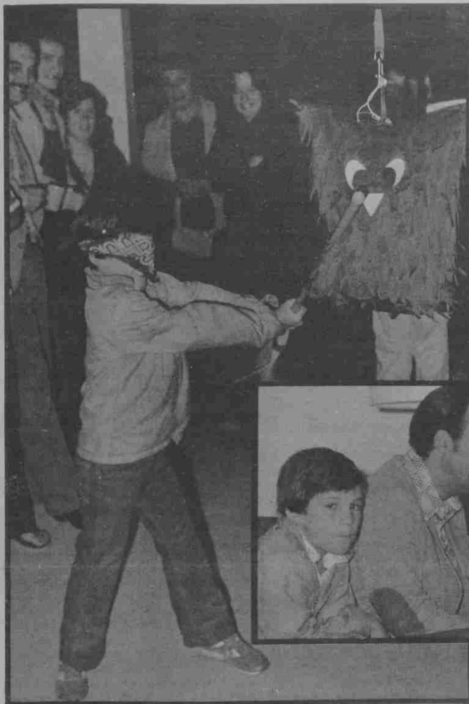
Breaking of the pinata, part of a Spanish evening at WU during Foreign Language Week