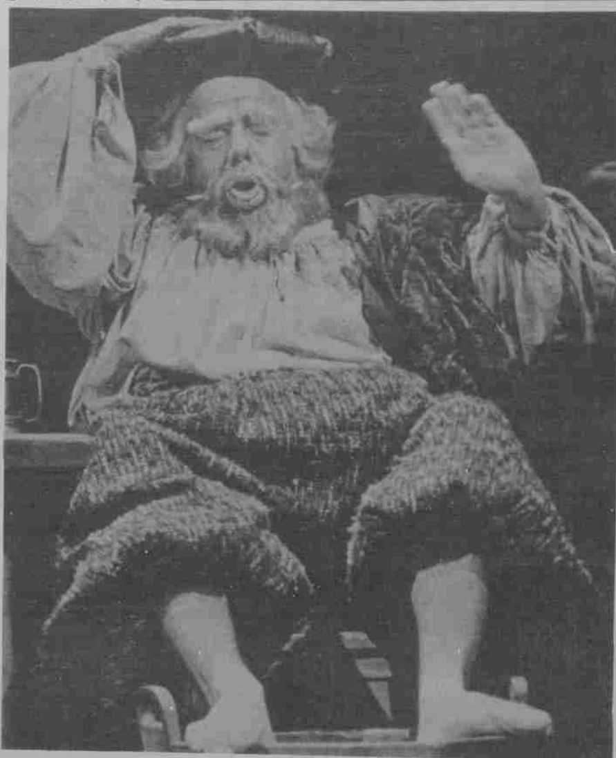
A scene from The Merry Wives of Windsor at the Oregon Shakespearean Festival.

For reservations or more information about the plays, call 482-4331 or write to Shakespeare, Ashland, OR 97520.