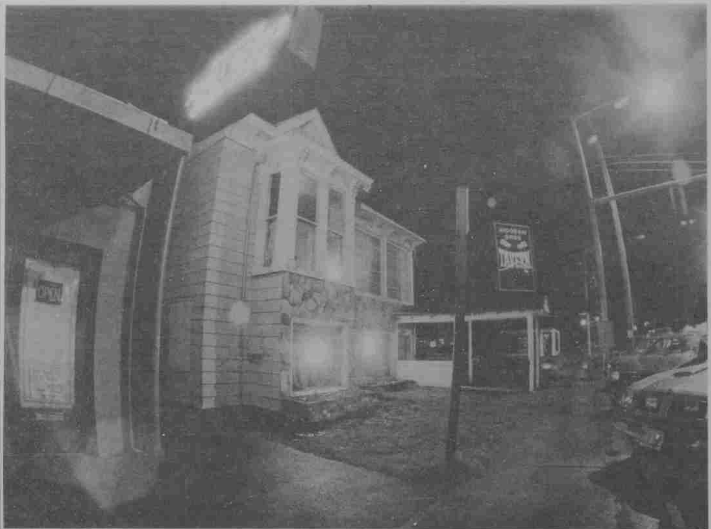
The Wooden Shoe Tavern, social gathering place for Salem's gay community.