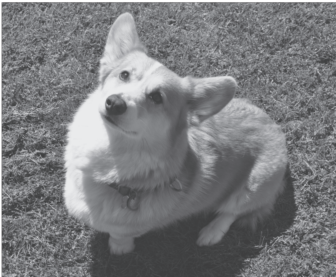
Move over Blitz! Red Rover, Red Rover, send Griffin the corgi over.