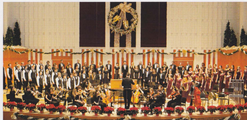
Annual production of Christmas in Hudson

Founded in 1842, Willamette was the first university established in the western United States. Oregon's capital city is home to Willamette University's 2,700 students and 300 faculty members across its undergraduate college and graduate schools of law and management.