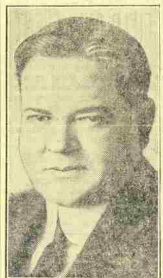
Herbert H. Hoover, who, according to coast colleges, will be next president