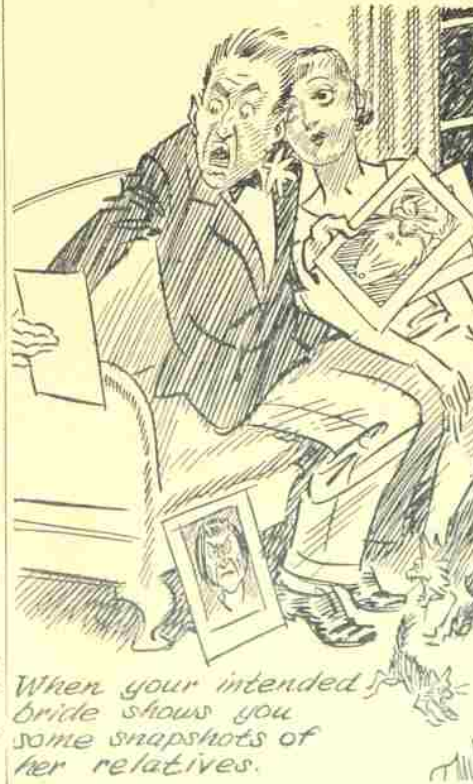
When your intended bride shows you some snapshots of her relatives.