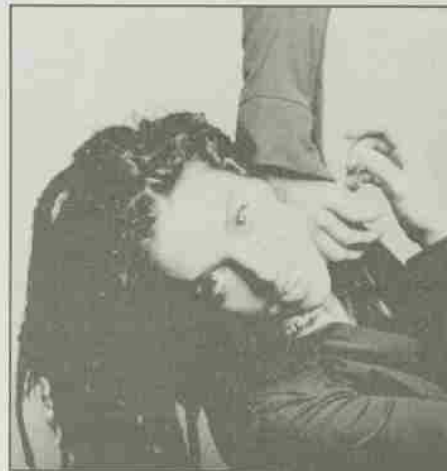
RIGHTEOUS BABE RECORDS

I suspect that the "flawed" beginning is actually a very calculated invitation into the exceptionally orchestrated, passionately performed