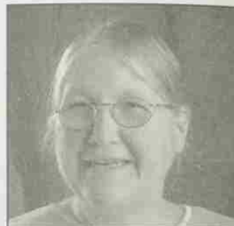
OFFICE OF COMMUNICATIONS

Another reason for delaying the search for a new full-time dean is because many members of the CLA faculty are unsure of the qualities