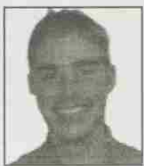
BY HANS BERNARD CONTRIBUTOR

Where our education failed us is what we have to make up in college. Many of us have assumed that we have learned everything there is to know when it comes to sex.