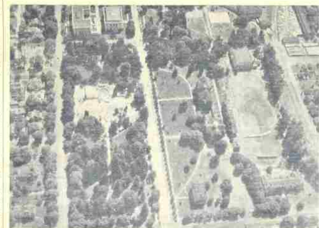
Airplane view of capitol grounds and campus showing how moving of university would enlarge state-house grounds. Plans at present are to rebuild Willamette on a site at Bush's Pasture.