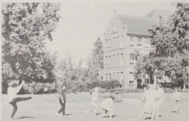
And in the spring, a young girl's fancy turns to . . . FOOTBALL!