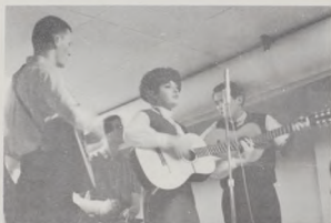
Folk singing as well as revival meetings are part of the AWS carnival