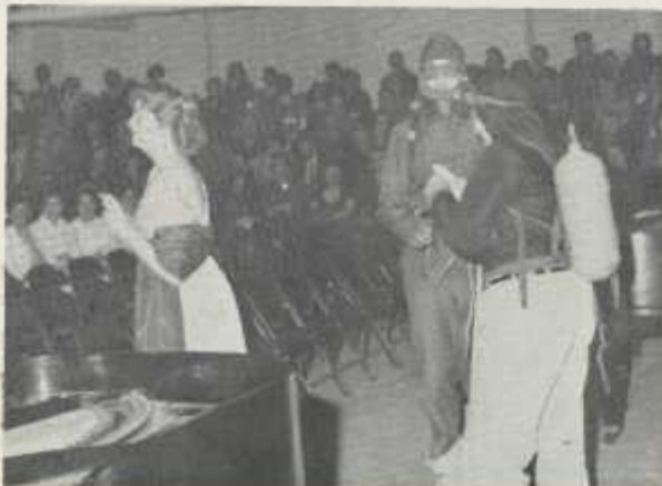
Sign-out even on Mt. Everest?