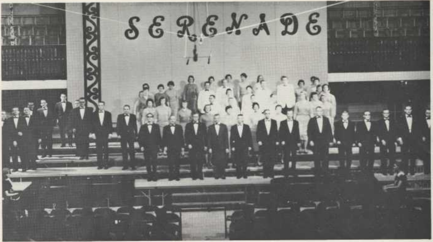
Stars, a rising moon, and a treble clef depict the senior's "Celestial Rhapsody".