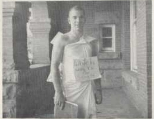
A distinguished Blue Monday visitor was this Roman solon.