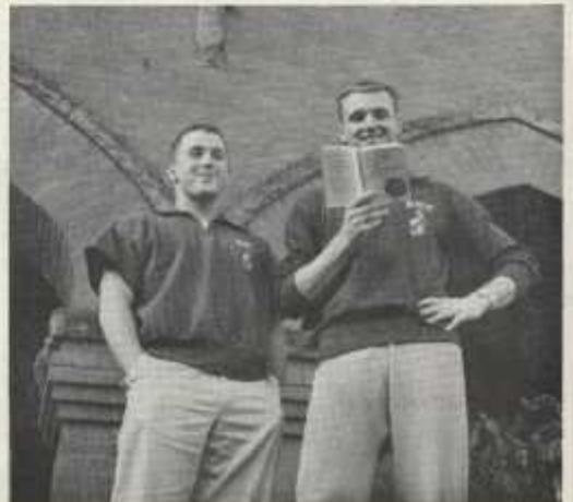
Blue Monday saw great literary classics explained on the steps of Eaton.