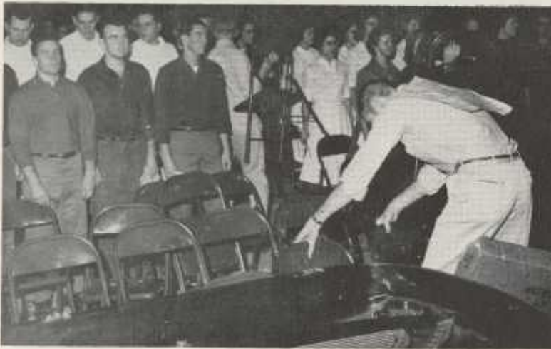
The Convo Chair Committee at work.