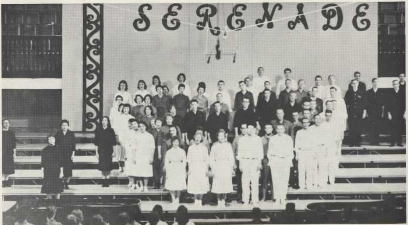
"Spring in our Hearts" brought a second win for the juniors.