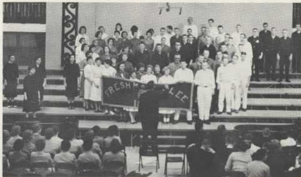
The victorious Class of '61.

Around this time of year the Willamette campus is lively with the anticipation of Freshman Glee. Every spare minute of the day is filled with song and formation practices. The sounds of up, two, three, four, pivot, two, three, four echo across the quad. Glee bets are made and later carried out on "Blue Monday". Freshman Glee, now in its fifty-second year, has come to be one of the most popular traditions on the Willamette campus.