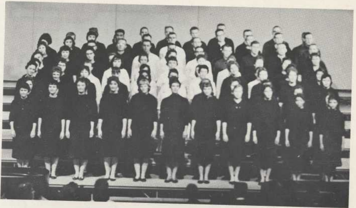
A star of white set the scene for the sophomore's "Seaswept Serenade".