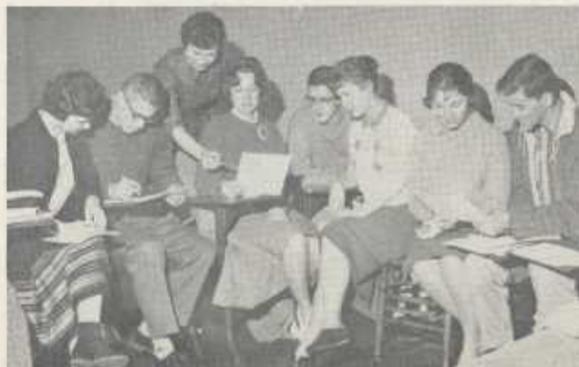
"Which pictures to use." The souvenir committee deliberates.