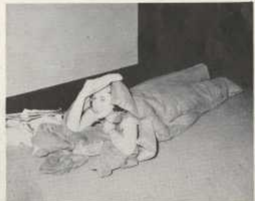
"Glee is such a fatiguing ordeal!"