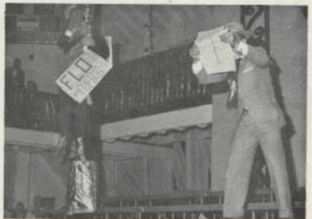
Flo Flu Bug takes to the air.