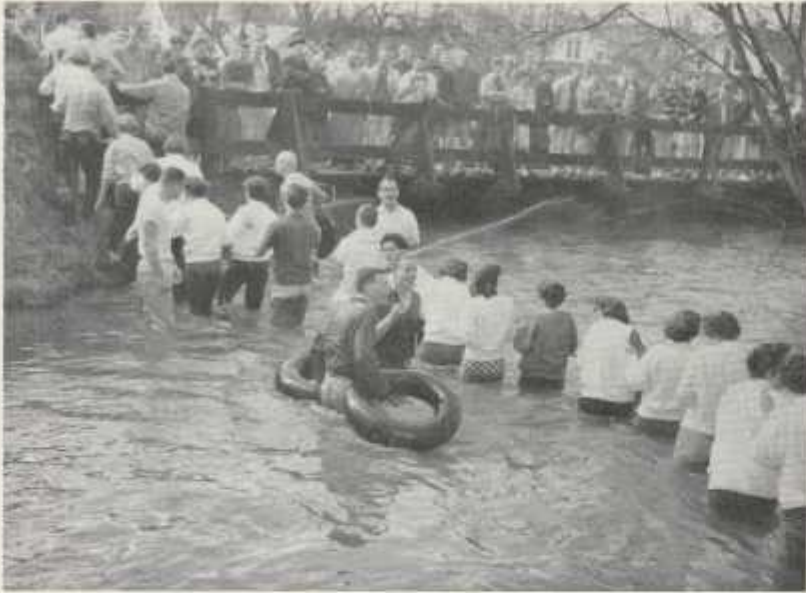
The sun appeared and the snow melted in time for the traditional crossing of the Mill Stream.