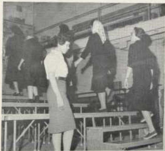
Up, 2, 3, 4. The frosh practice.