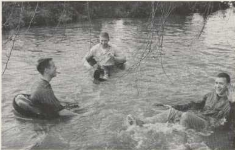
"Come on in — the water's fine."