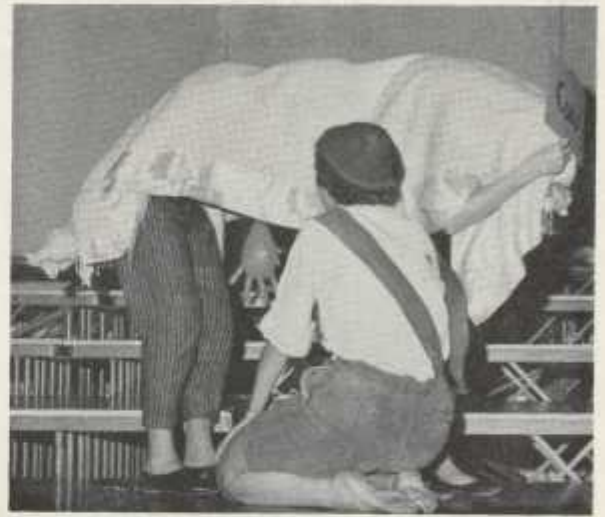
Milk for France.