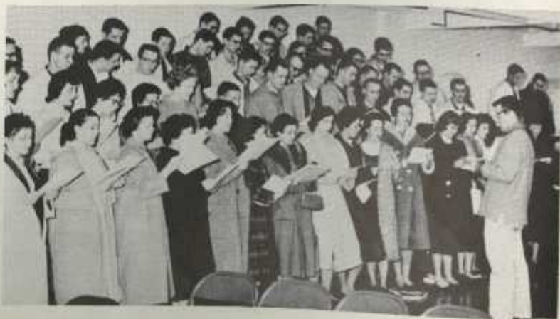
... and then the juniors.