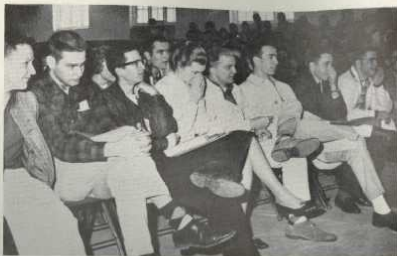
Seniors sniffle in sentiment.