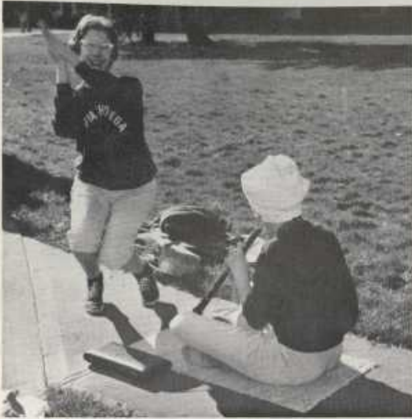
This Glee bet brought Hindu culture to the Willamette campus.