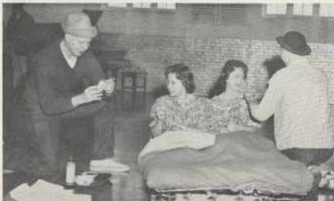
Two petite frosh find this breakfast a bit out of the ordinary.