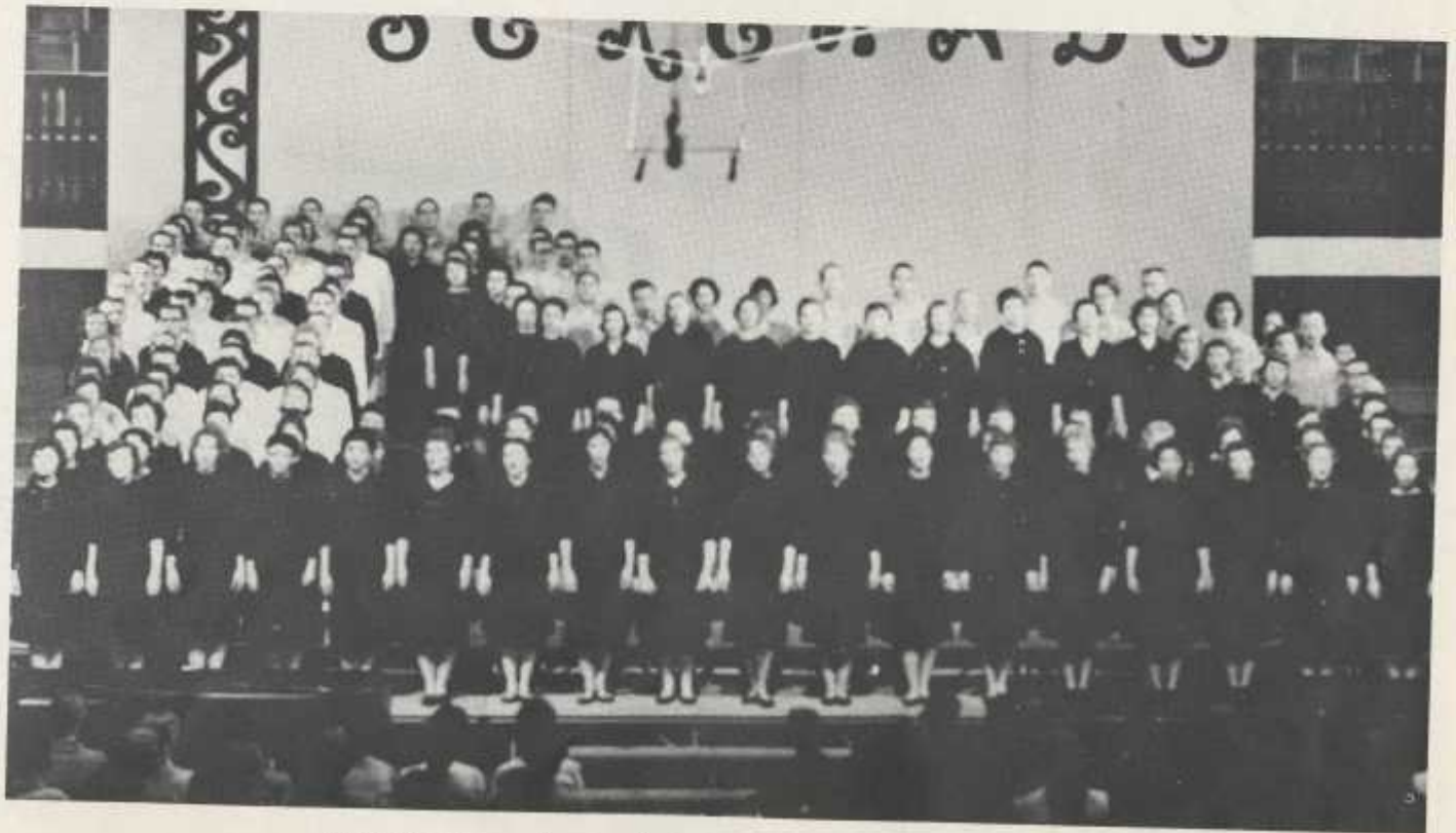
In the form of a grand piano, the freshmen present "Serenade in Black and White".