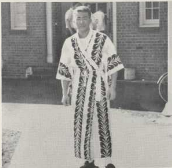
The amazing results of peroxide!