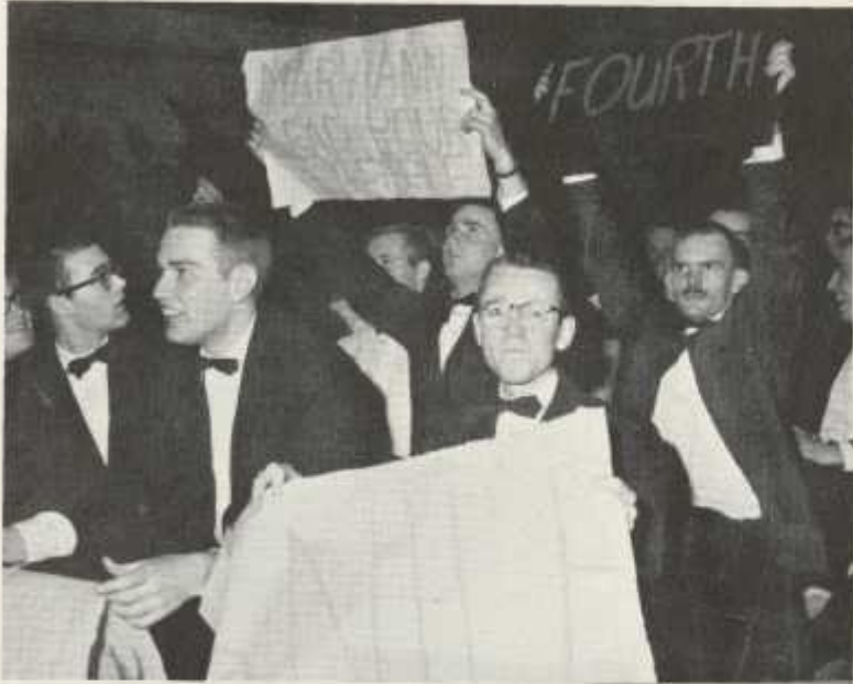
This is senior encouragement??