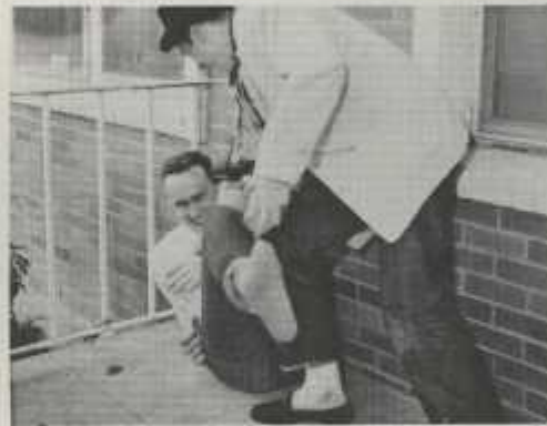
Doney porch was the scene of 15 minutes of free rib-tickling.