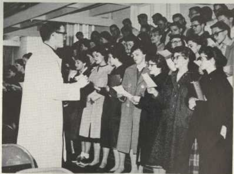
A confident sophomore class parodies the frosh song.