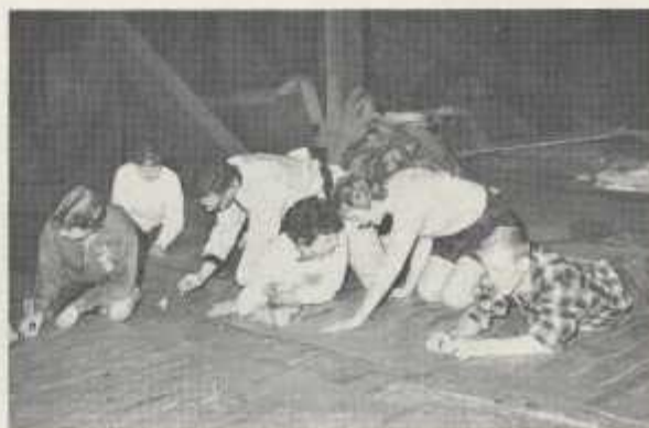
Fourth-floor Waller was the scene of many busy evenings for the decoration committee.