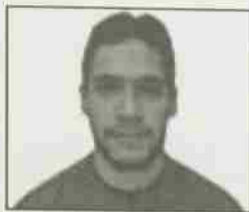
DAN RIVAS CONTRIBUTOR

NBC and its cable clones CNBC and MSNBC will broadcast a record 375.5 hours of Olympic Fever over 17 days, more than double the hours of the 1998 Nagano games.