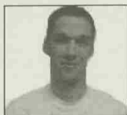
RICH SCHMIDT CONTRIBUTOR