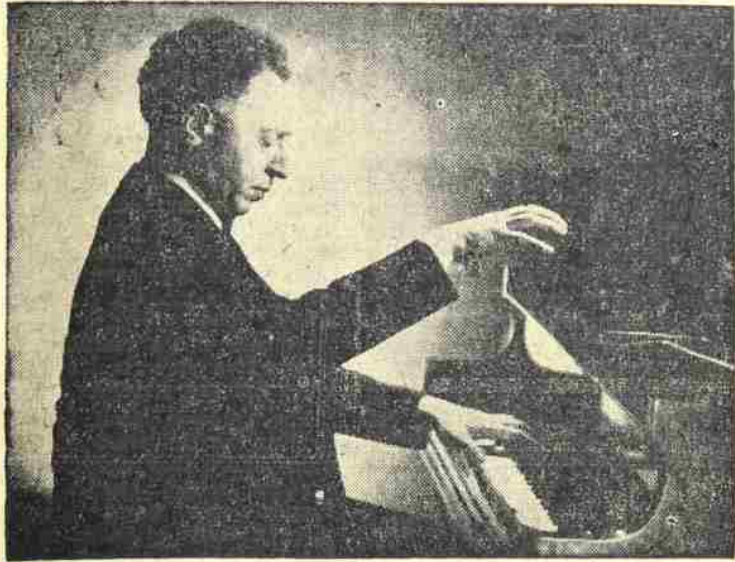
Artur Rubinstein, seated at piano in preparation for concert at Salem high auditorium October 3 at 8:15 p.m. Rubinstein has been acclaimed as one of the world's best pianists and is noted for leaving his audience in a roar and his piano limp.