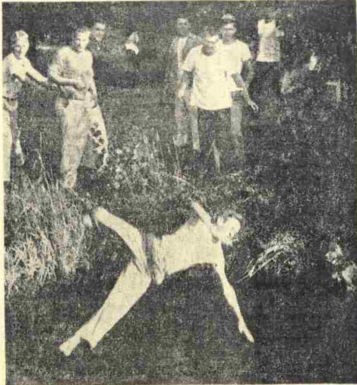
Pictured above is the result of the fact that there are such people as freshmen in this school. Finding that it was necessary to subdue the bountiful spirits of the new freshmen, the upperclassmen resolved to use the Mill stream method shown above.

The formal measure will state that "there shall be an assessment of one dollar for the purpose of aiding in financing of the Wallulah. This will be paid by all students who receive copies of the Wallulah, and shall be collected under the authority and supervision of the editor of said publication."