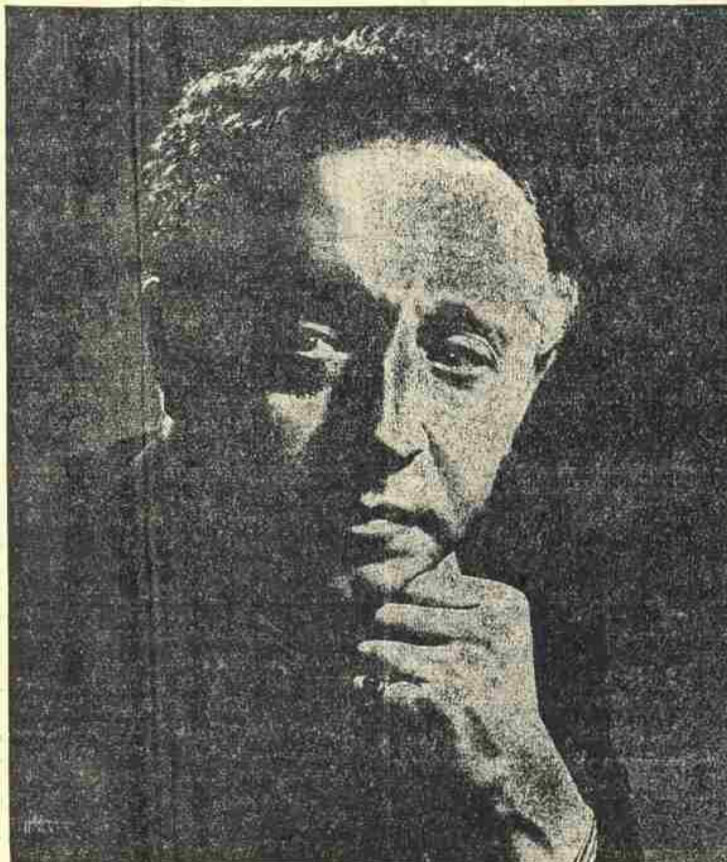
Artur Rubinstein, world famous pianist, who will appear in concert Tuesday evening, October 3, at the Salem high auditorium under the sponsorship of Willamette university.

According to the draft board a student, upon receiving an induction notice, may request and receive a postponement providing the request is accompanied by a certificate from the school stating that the registrant is "satisfactorily" pursuing a full time course of study.