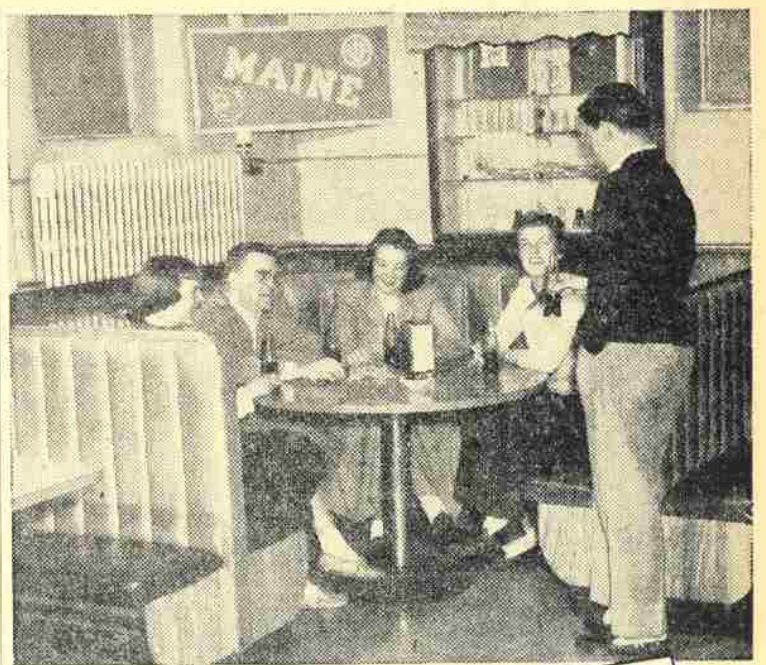
Snack Bar in Carnegie Library University of Maine Orono, Maine