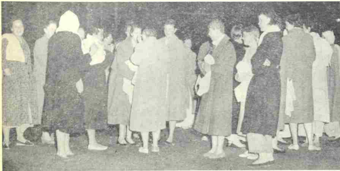
Except for an obvious lack of flames licking out the windows, and panic on the faces of the "victims," the disaster scene shown in this picture demonstrates effectively the institution well known to Doney's women (roused from their slumbers) as "fire drill."