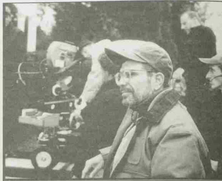
FINE LINE FEATURES

Mamet produces a masterpiece in a very dull year in film.