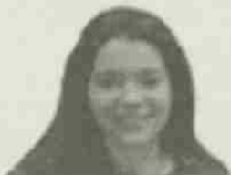
By ANGELA COSTA COLUMNIST

The deafening sound of tens of thousands cheering, stomping, screaming, screeching, straining voices make the air heavy in the stadium that is filled to its incredible capacity.