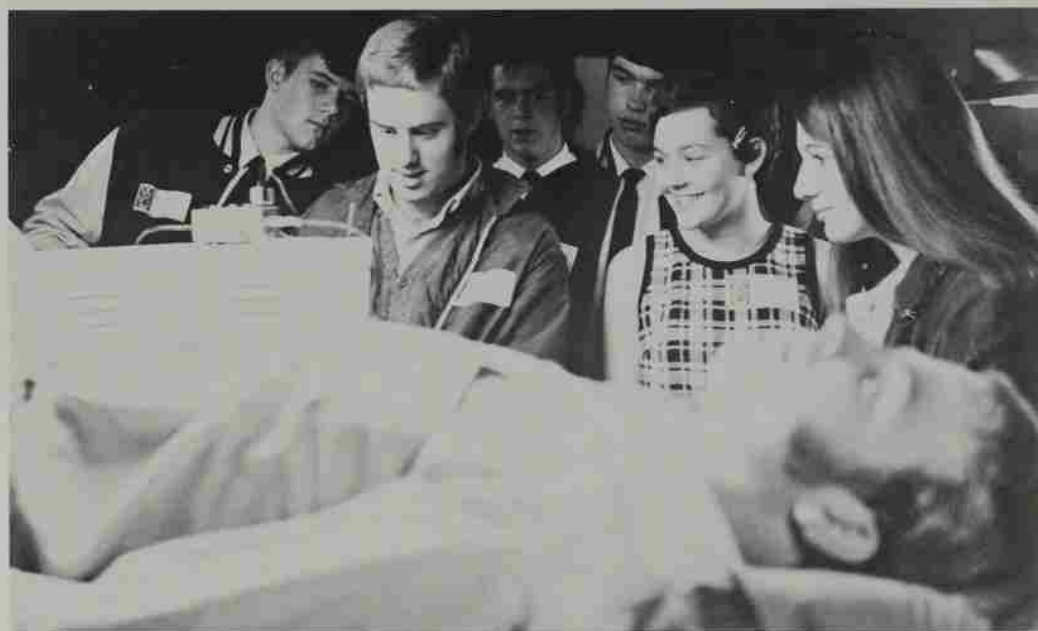
ELECTROCARDIOGRAPHY captures the interest of visiting high school students who attended Science Day at Willamette recently.

He went on to express an opinion that Willamette and liberal arts colleges in general can help satisfy a real need in society for scientists with liberal arts backgrounds. "The scientist who has an appreciation and an awareness of the other disciplines can more effectively communicate his ideas to people in the other fields of interest."