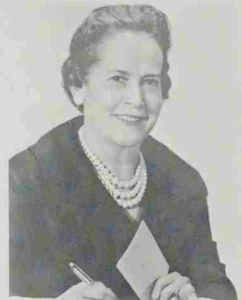
Rep. Edith Green, Alumni Speaker

U.S. CONGRESSWOMAN Edith Green will be among the alumni returning for a busy Alumni Day observance. She will keynote the banquet in the new George Putnam University Center at which time the Alumni Citation winners and Matthews Medallion recipients will be honored. Reunion luncheons for classes ending in "0" and "5" from 1920 through 1950 will be held, and the Willamette Choir and Musical Kaleidoscope will present its final home concert before embarking on a six-week European tour. Plan to attend the May 16 festivities.