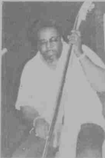
One-third of a three-man trio readies his instrument for what was a dazzling performance at the Expressions Campus-Community Dinner.