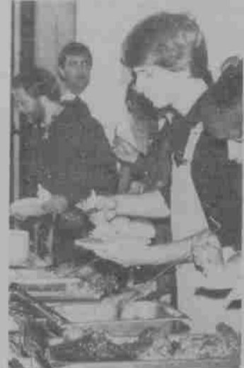
Campus and Community members dig into the dinner hosted by the MSU as part of Expressions IV.