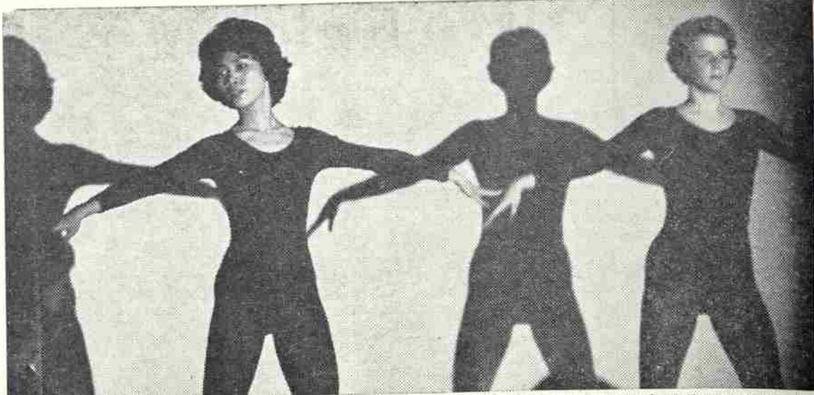
Members of the Oregon State University Dance Group participating in the Festival of Contemporary Arts last Tuesday. Many guests from off-campus helped enliven Willamette's cultural atmosphere this week.