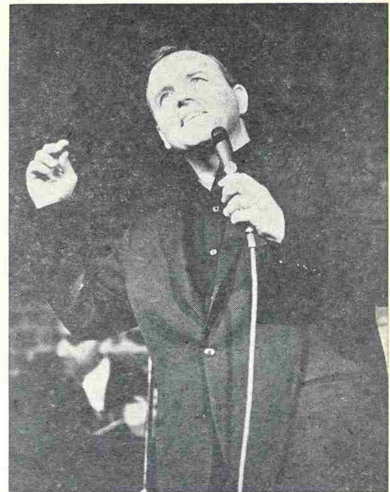
"He whistled and he sang till the green wood rang and he stole the heart of the lady," sings the Original Gypsy Rover, Glenn Yarbrough, rehearsing at the Hungry I, for his Willamette appearance April 16. (See story, page 2.)