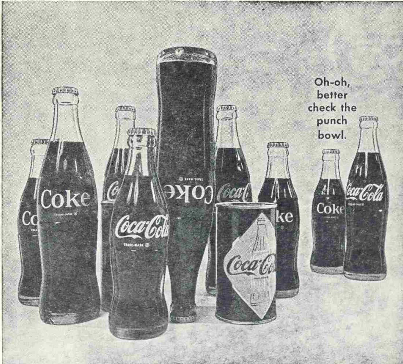
"Coca-Cola" and "Coke" are registered trade-marks which identify only the product of The Coca-Cola Company.

We want to make the major quite important. We want to be sure that the courses offered under the major are so good, so strong. We want the student to feel quite comfortable about his choice of major and that he will be well prepared for almost any vocational or professional opportunity.