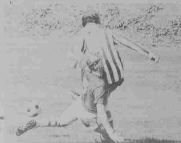
Colliding in mid-stride, this Bearcat soccer player fails to stop a scoring attempt by Linfield opponent. It was one of the few bright spots for Linfield; the Bearcat kickers routed the Wild-cats 6-1.

connected on a shot flying up from his right wing position. Linfield did manage to score twice, once on a penalty kick and once on a corner kick, but never could muster any type of sustained offensive thrust against the iron-clad W.U. defense.