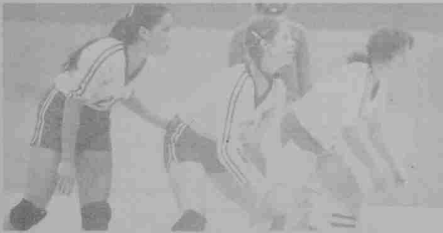
VOLLEYBALLERS PREPARE FOR ATTACK