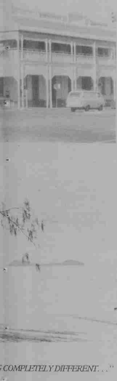
COMPLETELY DIFFERENT. ..."

In the next Down Under Log , I'll get into the nuts and bolts of travelling to Australia, where and how to go, and, most importantly, how much it will cost you, as the adventurer.