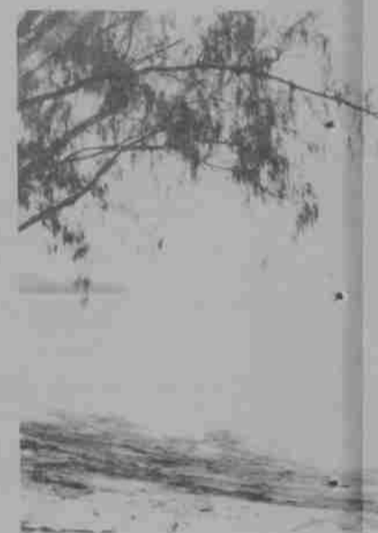
"AND NOW FOR SOMETHING"