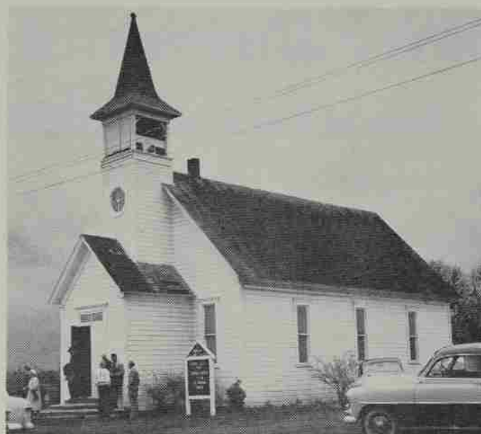
Marquam Methodist Church