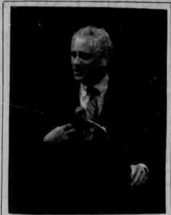
The Gov Pledging Phi Dolt

Rumor even has it that many members of Keepa Slugma are dropping their pins so that they can be eligible to receive a bid from the Phi Dolt's. If the Keepa Slugma chapter folds due to a