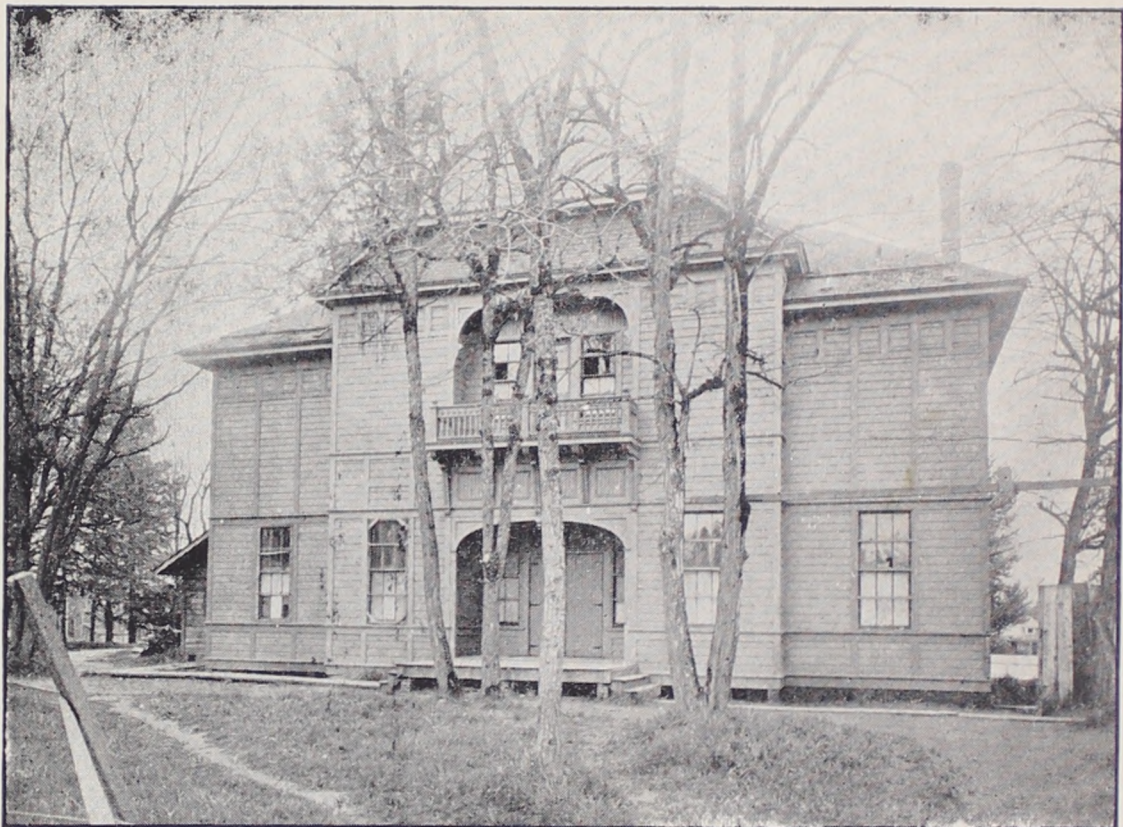
GYMNASIUM Fine Athletic Field Adjoining