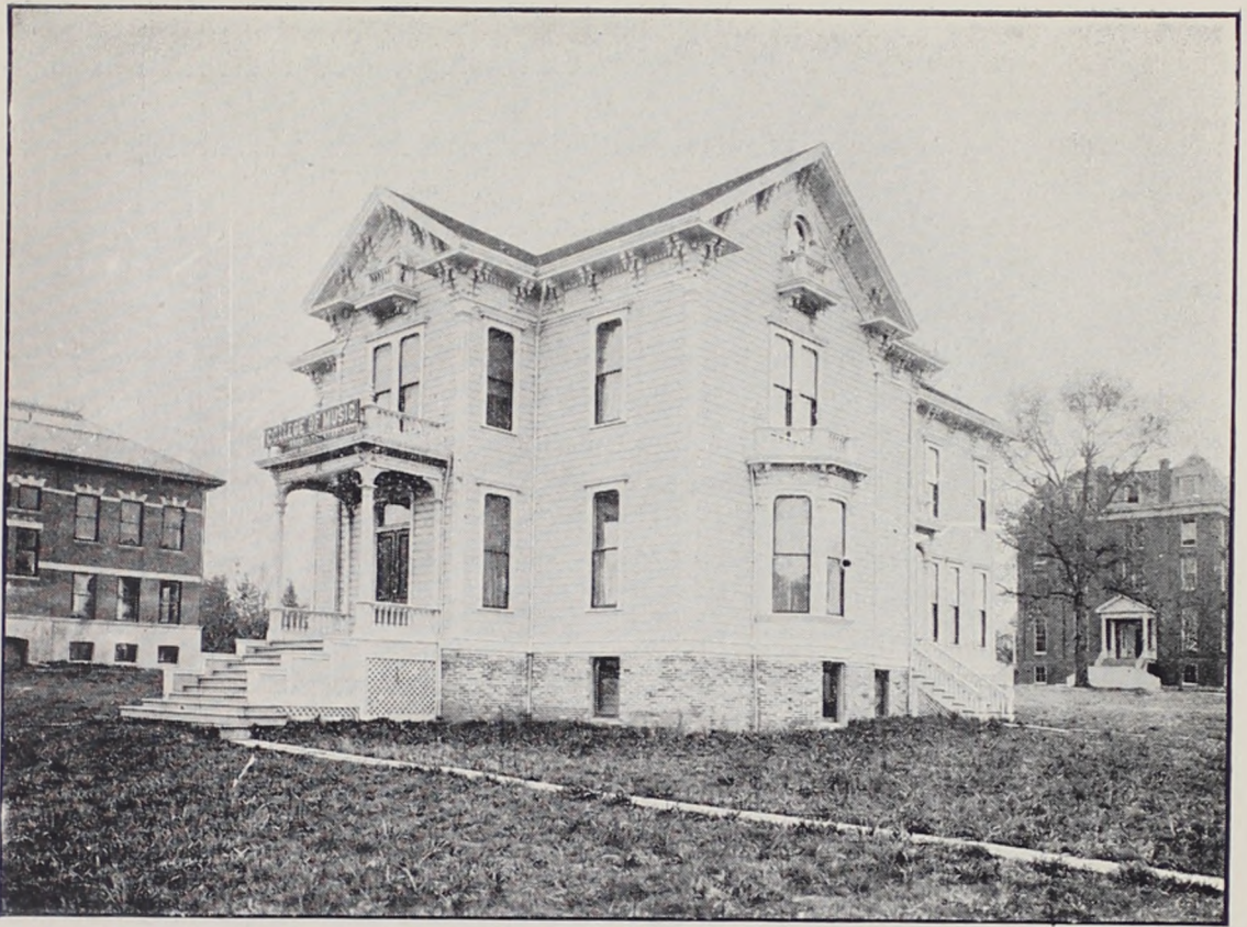
MUSIC BUILDING (Gift of W. W. Brown)