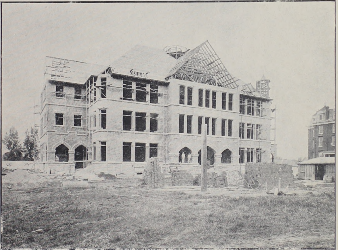
EATON HALL—COST $50,000 (Gift of Hon. A. E. Eaton)

Entered as second class matter, July 27, 1908, at the Post Office at Salem, Oregon, under the Act of July 16, 1894