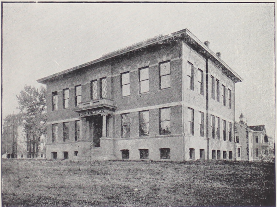
MEDICAL BUILDING (Gift of Citizens of Salem)