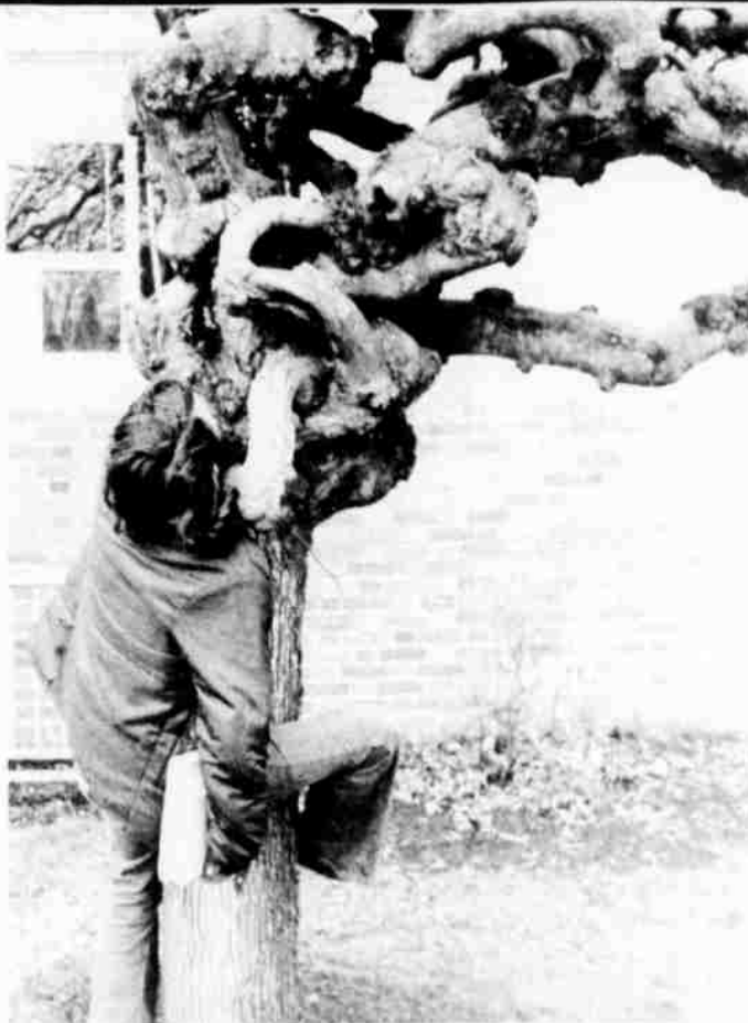
Don't add to the confusion.

(look that up in your JOYS OF YIDDISH, goy)