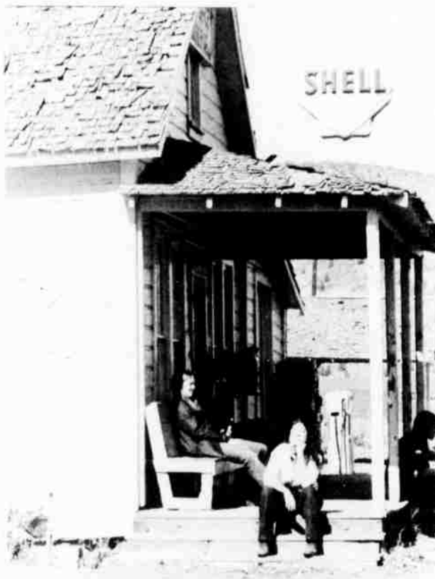
What gas shortage?????

The Rainier Snowbust series moves to Snowblaze, Mt. Spokane, this Sunday, January 27, with all the action getting underway at 12 Noon. The Snowbusts, presented by Rainier Brewing Company, consist of a wide range of events for skiers and non-skiers alike. Among them are snow sculpturing, cherry pie eating, keg putting and slalom races as well as the two Porsche professional events. Participation in the events is free and there are a variety of prizes ranging from K-2 skis and boots to O'Brien water skis, TV's, radios, Ski Kolor ski poles and Farwest ski wear.