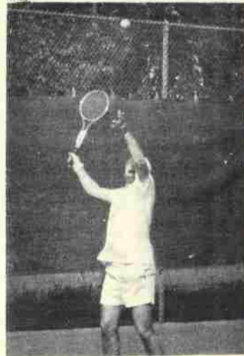
THE excellent weather has allowed many of Willamette's tennis "bums" to sharpen up their serve.