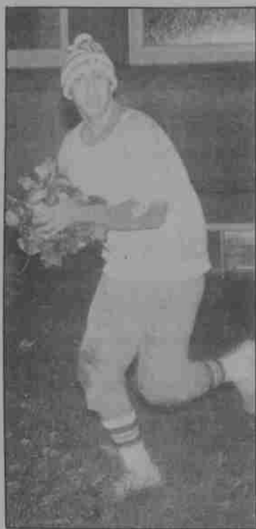
Unidentified freshman dashes by with a pile of soggy leaves