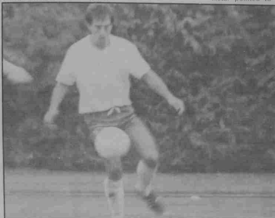
An unidentified soccer player prepares to sock the ball into the opponent's territory.

"For as hurt and tired as they (the Bearcats) were, they really played well."