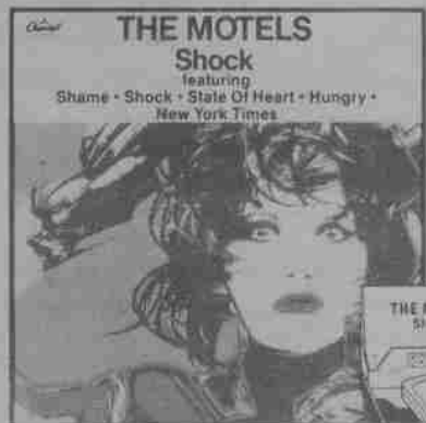
The Motels "Shock" Capitol Records