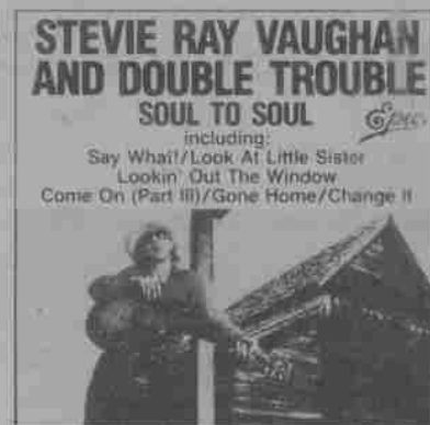
Stevie Ray Vaughan "Soul to Soul" Epic Records