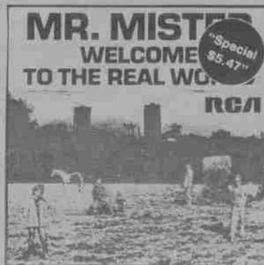
Mr. Mister "Welcome to the Real World" RCA Records