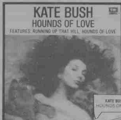
Kate Bush "Hounds of Love" EMI Records