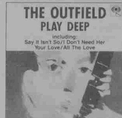
The Outfield "Play Deep" Columbia Records

The Fred Meyer record departments always have your favorite music for less! Prices good through Nov. 1st.