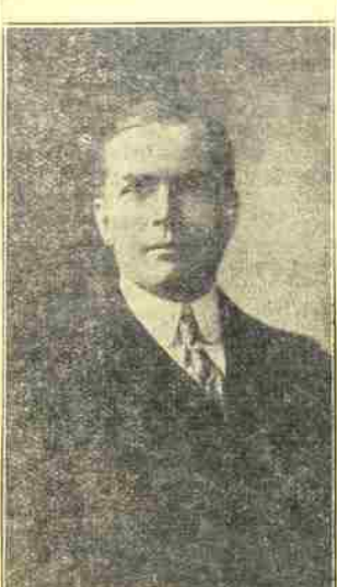
DR. JOHN R. MOTT

Both boys seem to be taking their injuries with the best of spirits. They are receiving friends during visiting hours and many of the students are taking it upon themselves to make a call at the hospital, which is located at the east end of Center street, across from the Asylum grounds.