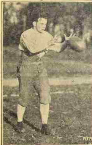
"Red" is the boy who makes fun of the opponents' line.