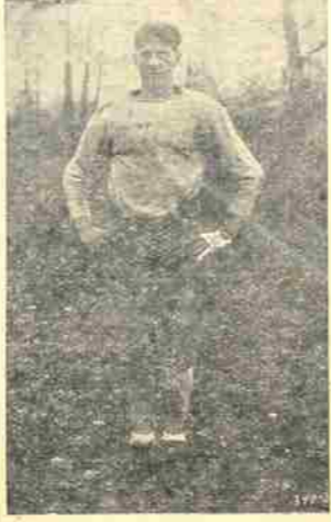
"Ack" sticks clear through the games. He's a first-class center.